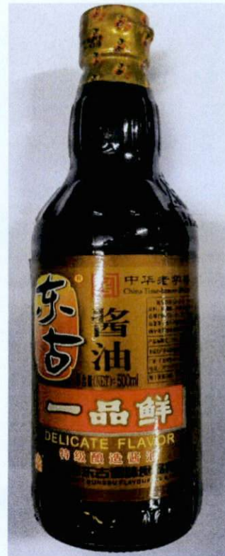
Figure 5. Unregistered CHINA TIME-HONOURED BRAND Delicate Flavor, 500ml (in foreign language; Barcode: 6911567881169)