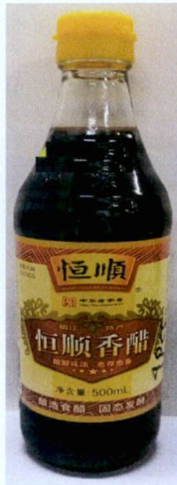
Figure 1. Unregistered (UNBRANDED) Black Liquid in yellow packaging, Glass bottle 500mL (in foreign language, barcode: 6902007010775)

The Food and Drug Administration (FDA) warns all healthcare professionals and the general public NOT TO PURCHASE AND CONSUME the following unregistered food products: