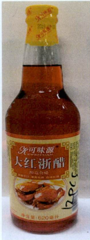
Figure 2. Unregistered WEIYUAN (clear red liquid in glass bottle) (in foreign language, BarCode: 6908947090235)