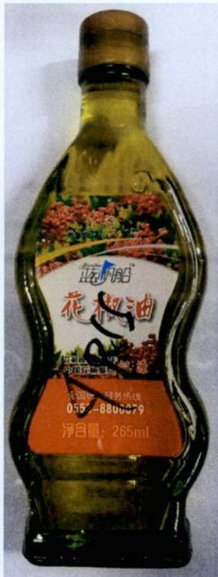
Figure 4. Unregistered (UNBRANDED) Clear greenish-brown liquid in glass bottle, 265mL (in foreign language; Barcode: 6970432609352)