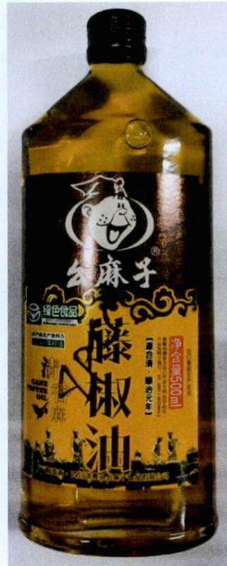
Figure 3. Unregistered (UNBRANDED) Cane Pepper Oil, 500ml