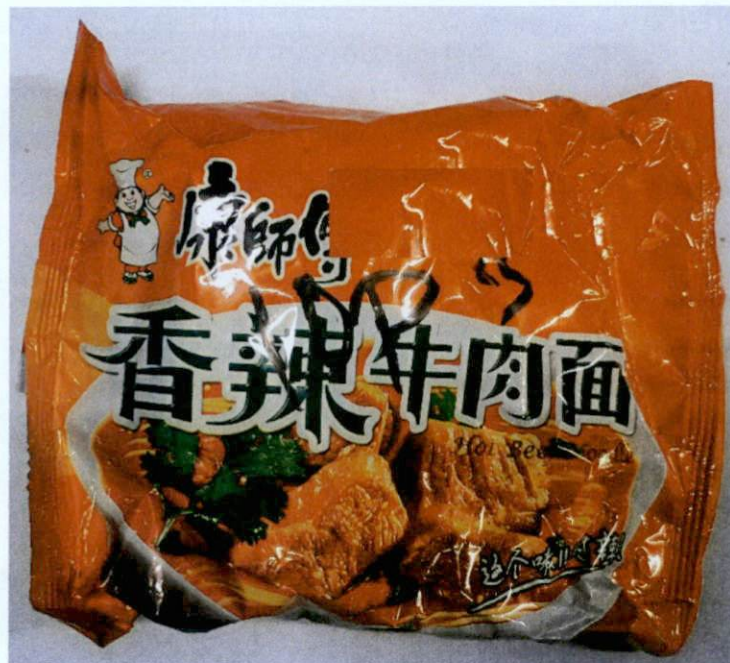
Figure 1. Unregistered (UNBRANDED) Hot Beef Noodle (in foreign language, barcode: 6900873060269)

The Food and Drug Administration (FDA) warns all healthcare professionals and the general public NOT TO PURCHASE AND CONSUME the following unregistered food products: