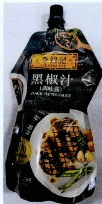
Figure 5. Unregistered LEE KUM KEE Black Pepper Sauce