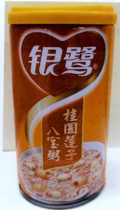
Figure 3. Unregistered (UNBRANDED) Red Tin Can With Orange Cap with image of Lychee and Nuts (in foreign language, BarCode: 6926892527088)