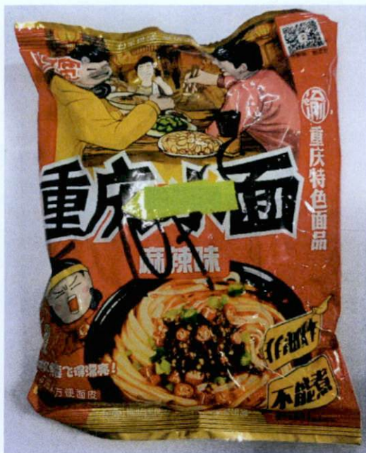
Figure 4. Unregistered (UNBRANDED) Noodles with image of Noodles in Black Bowl (in foreign language; Barcode:6926410330879)