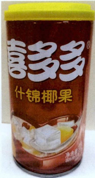
Figure 2. Unregistered (UNBRANDED) Red Tin Can With Yellow Cap with image of Red Berries, Pineapples (in foreign language, BarCode: 6923523902559)