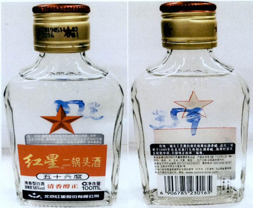
Figure 4 . Unregistered Colorless Liquid in Glass Bottle, 100ml (Red, White and Blue label with star image(in foreign language, barcode:6906785230165)