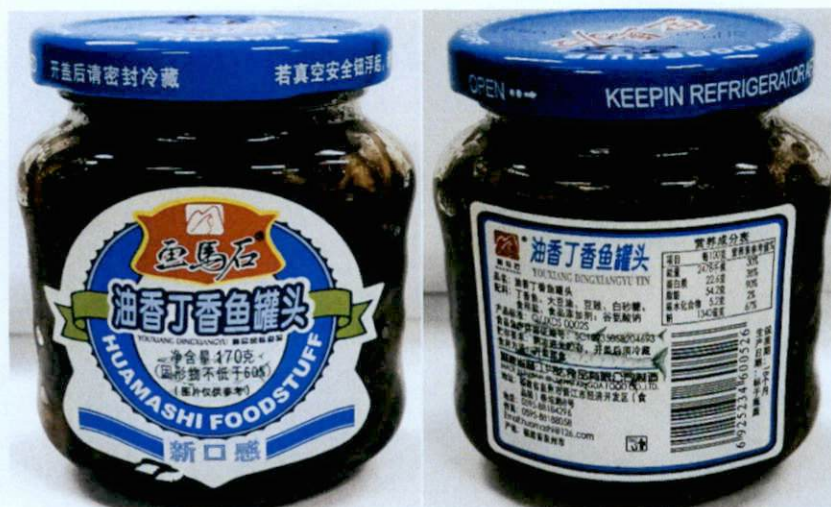
Figure 2 . Unregistered HUAMASHI FOODSTUFF YOUXIANG DINGXIANGYU (in foreign language, barcode: 6925234600526)