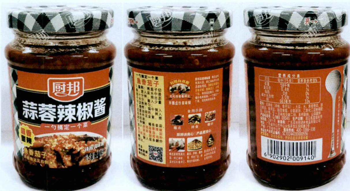
Figure 3 . Unregistered Red Chili Paste in Glass Bottle 210g (in foreign language, barcode:6902902009140)