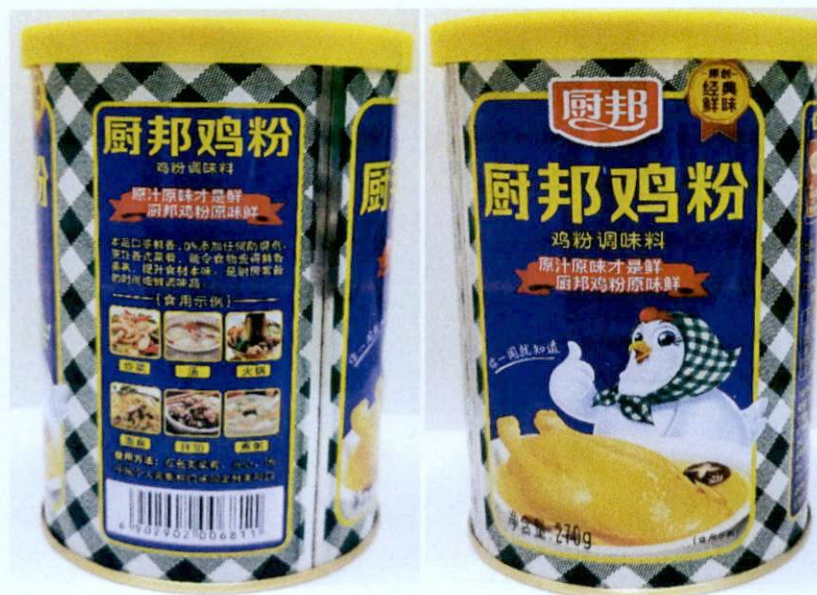
Figure 1. Unregistered Food in Aluminum Can with Blue, White and Green label and Chicken artwork with Foreign Text, 270g BARCODE: 6902902006811

The Food and Drug Administration (FDA) warns all healthcare professionals and the general public NOT TO PURCHASE AND CONSUME the following unregistered food products: