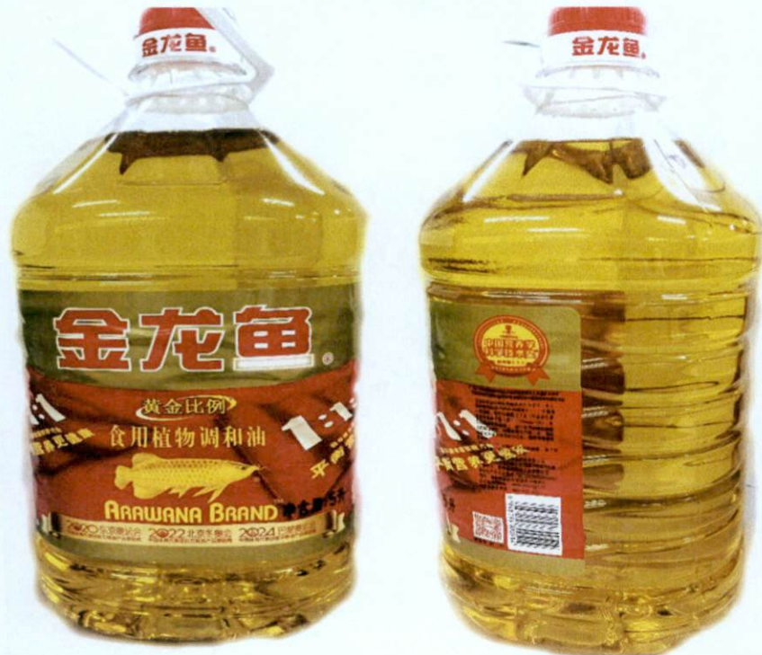
Figure 5 . Unregistered Unregistered ARAWANA BRAND (Oil) 5L (in foreign language, barcode: 6948195800514)