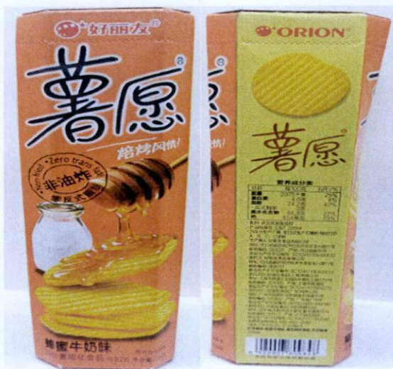
Figure 3. Unregistered ORION Potato Chips in Orange Box with Milk and Honey (Labels are in foreign Characters)