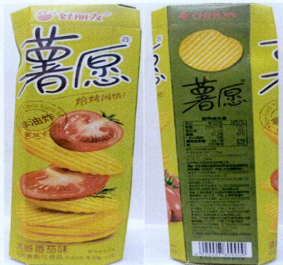
Figure 4. Unregistered ORION Potato Chips in Green Box with Tomato Drawing (Labels are in foreign Characters)