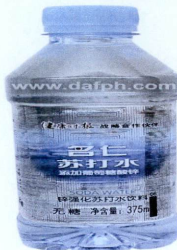
Figure 5. Unregistered Soda Water in Plastic Bottle with Blue Label, 375ml (Labels are in foreign Characters)