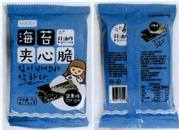
Figure 2. Unregistered Chengshilianren (Seaweed like product in Blue Packaging), 4g (Labels are in foreign Characters)