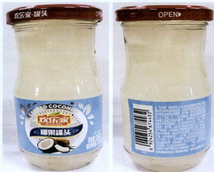
Figure 1. Unregistered HUANLEJIA Canned Coconut (Labels are in foreign Characters)

The Food and Drug Administration (FDA) warns all healthcare professionals and the general public NOT TO PURCHASE AND CONSUME the following unregistered food products: