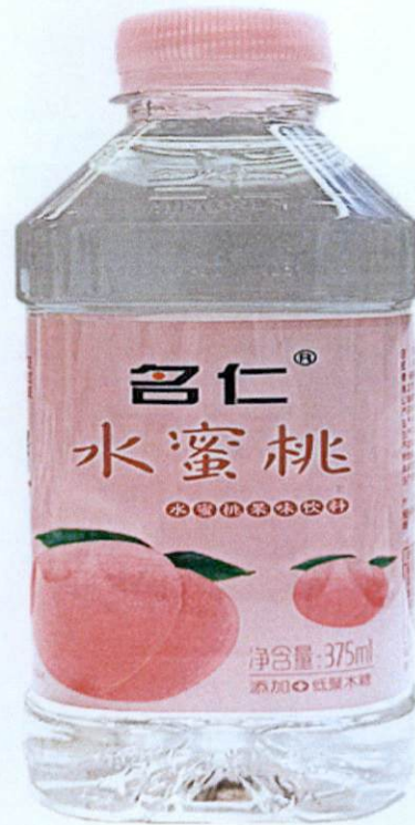
Figure 3. Unregistered Bottled Water like in Plastic Bottle with Pink Label and peach Drawing, 375ml (Labels are in foreign Characters)