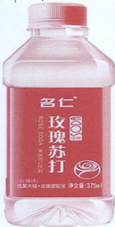
Figure 2. Unregistered SODA ROSE Soda in Plastic Bottle with Pink Label, 375ml (Labels are in foreign Characters)