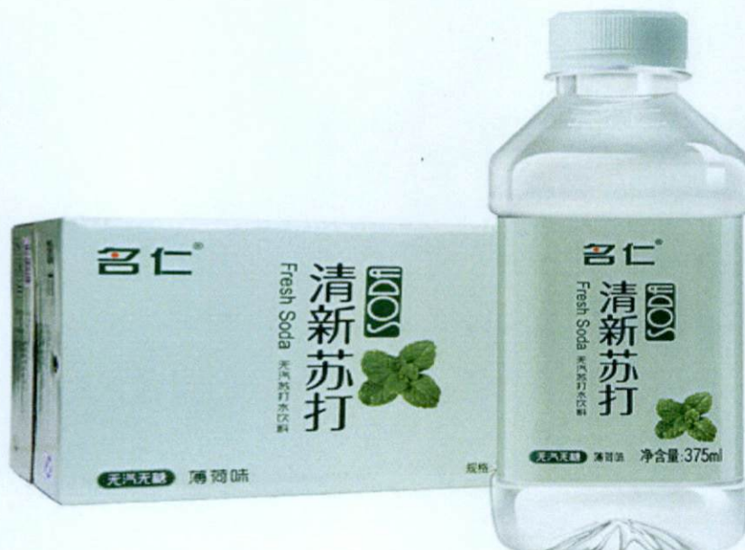
Figure 1. Unregistered Fresh Soda Water Plastic Bottle with Green Label, 375ml (Labels are in foreign Characters)

The Food and Drug Administration (FDA) warns all healthcare professionals and the general public NOT TO PURCHASE AND CONSUME the following unregistered food products: