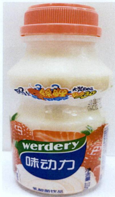
Figure 4. Unregistered WERDERY (Drink like in a Bottle with Strawberry Drawing) (Labels are in foreign Characters)