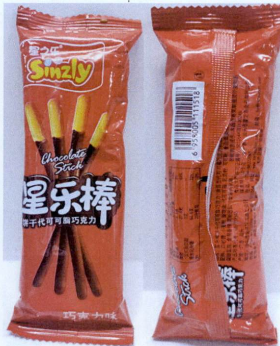
Figure 4. Unregistered SINZLY Chocolate Stick (in Red Foil Pouch) (Labels are in foreign Characters)