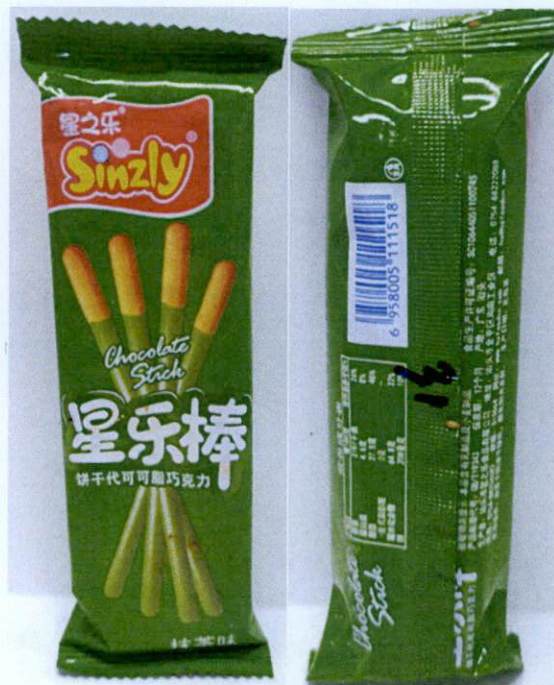
Figure 5. Unregistered SINZLY Chocolate Stick (in Green Foil Pouch) (Labels are in foreign Characters)