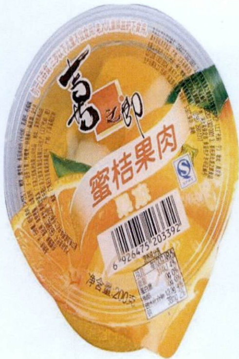
Figure 2. Unregistered Jelly in Plastic Jar with Orange Drawing (Labels are in foreign Characters)