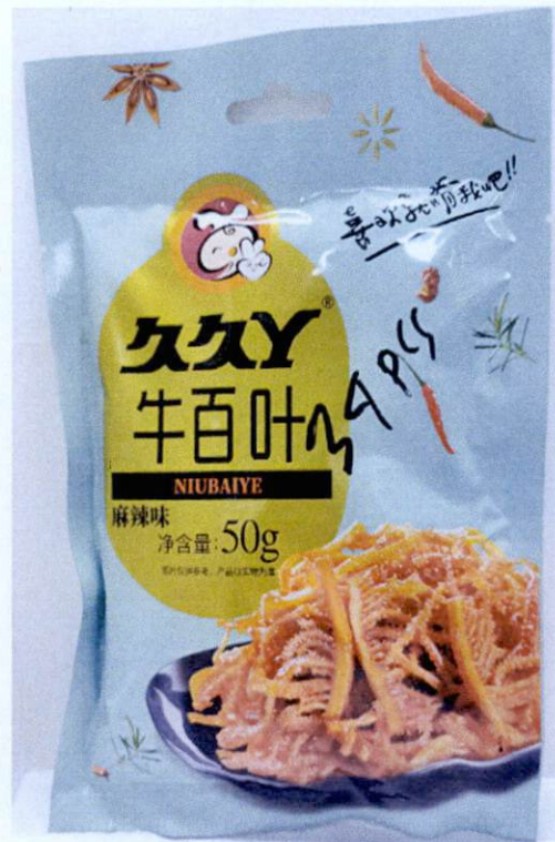
Figure 3. Unregistered NUBAIYE, 50g (Labels are in foreign Characters)