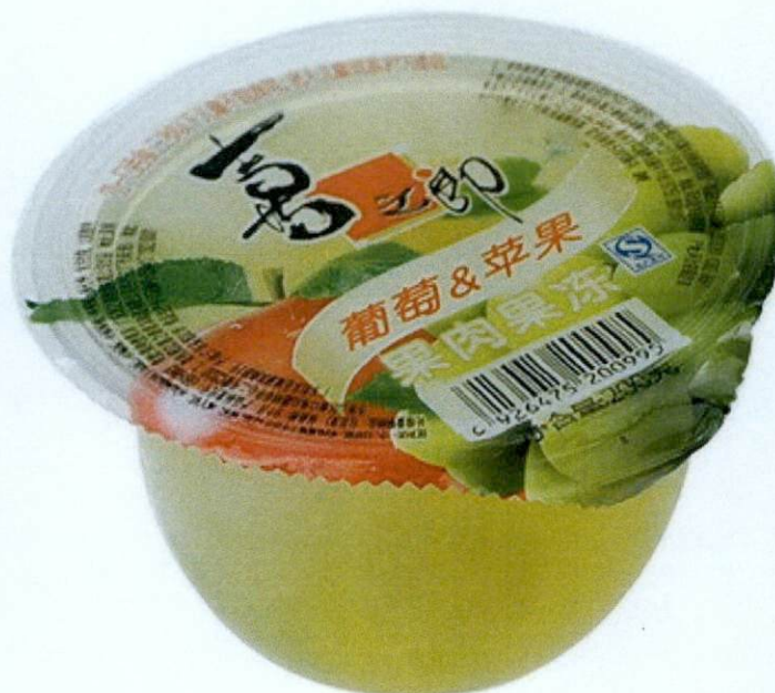
Figure 1. Unregistered Jelly in Plastic Jar with Apple and Grapes Drawing (Labels are in foreign Characters)

The Food and Drug Administration (FDA) warns all healthcare professionals and the general public NOT TO PURCHASE AND CONSUME the following unregistered food products: