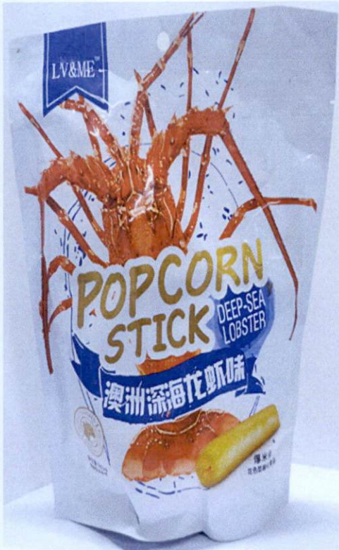
Figure 2. Unregistered LV&ME Popcorn Stick Deep-Sea Lobster Labels are in foreign Characters)