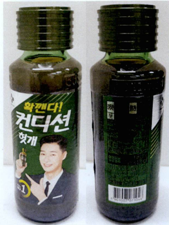
Figure 3. Unregistered CONDITION Drink (in Glass Bottle with Green Cap and Green Label) (Labels are in foreign Characters)