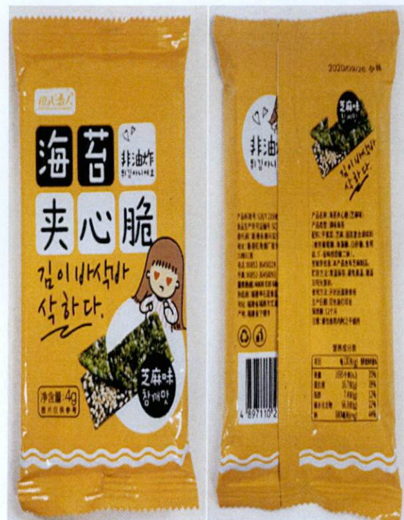
Figure 5. Unregistered CHENGSHILIANREN (Seaweed like product in Yellow Packaging) (Labels are in foreign Characters)