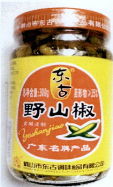
Figure 4. Unregistered YESHANJIAO (in Jar with Yellow Label) (Labels are in foreign Characters)