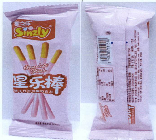
Figure 1. Unregistered SINZLY Chocolate Stick (in Pink Foil Pouch) (Labels are in foreign Characters)

The Food and Drug Administration (FDA) warns all healthcare professionals and the general public NOT TO PURCHASE AND CONSUME the following unregistered food products: