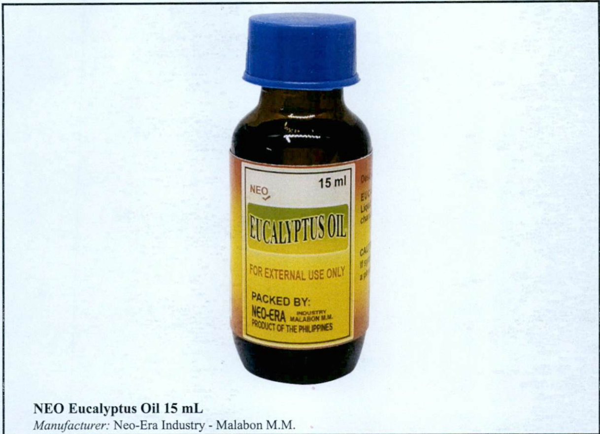
NEO Eucalyptus Oil 15 mL

Manufacturer: Neo-Era Industry - Malabon M.M.