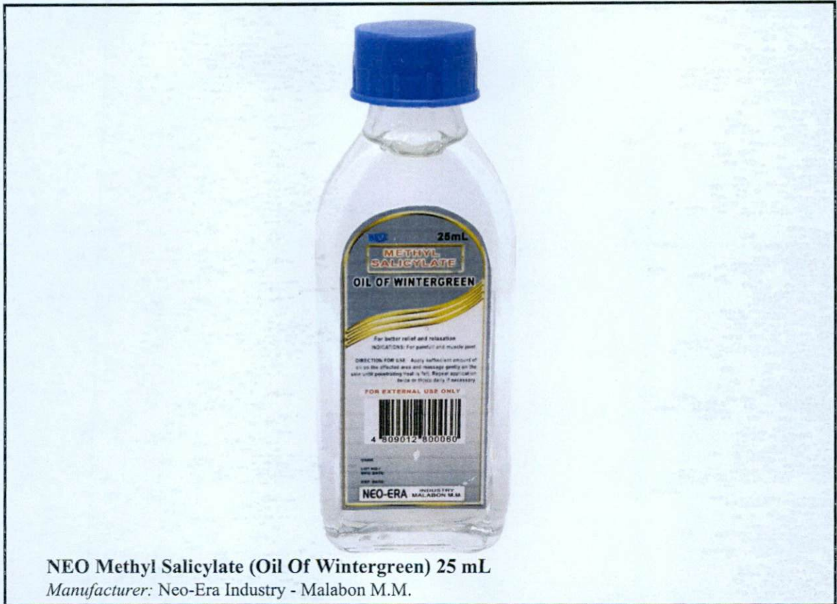
NEO Methyl Salicylate (Oil Of Wintergreen) 25 mL Manufacturer: Neo-Era Industry - Malabon M.M.