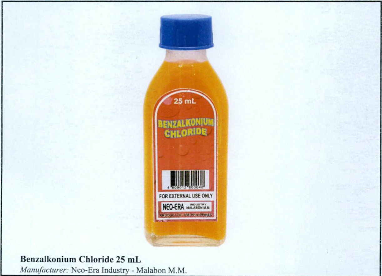
Benzalkonium Chloride 25 mL Manufacturer: Neo-Era Industry - Malabon M.M.