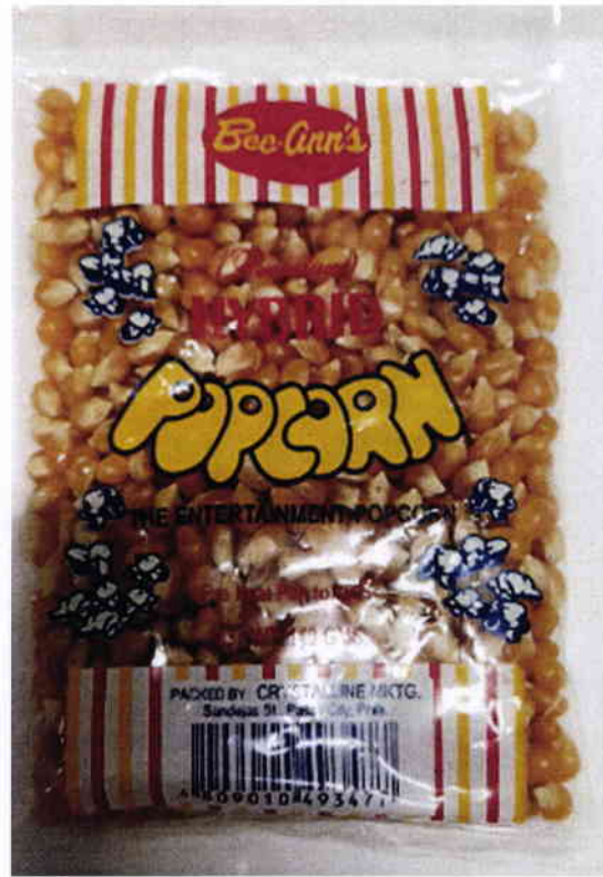
Figure 3. Unregistered BEE-ANN'S Hybrid Popcorn, Net Wt. 140gms.