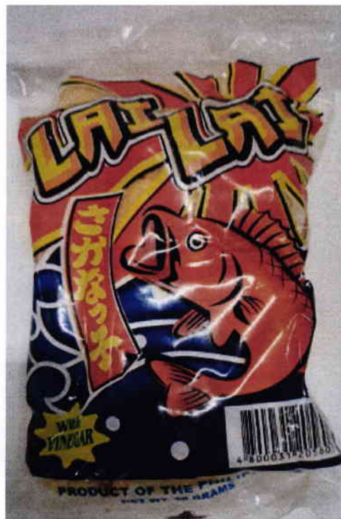
Figure 4. Unregistered LAILAI with Vinegar (Fish Cracker), Net Wt. 30g