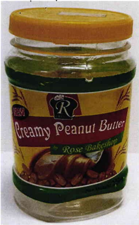
Figure 2. Unregistered ROSE Creamy Peanut Butter, Net Wt. 250g