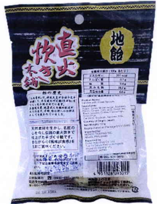
Figure 4. Unregistered Candies with Mixed Flavours