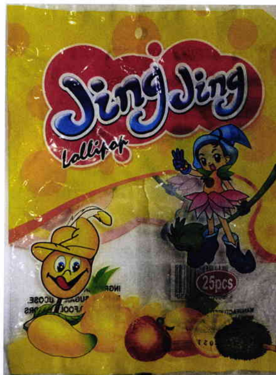
Figure 1. Unregistered JING JING Lollipop

The Food and Drug Administration (FDA) warns all healthcare professionals and the general public NOT TO PURCHASE AND CONSUME the following unregistered food products: