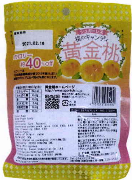
Figure 2. Unregistered OGONTOH Golden Peach Candy