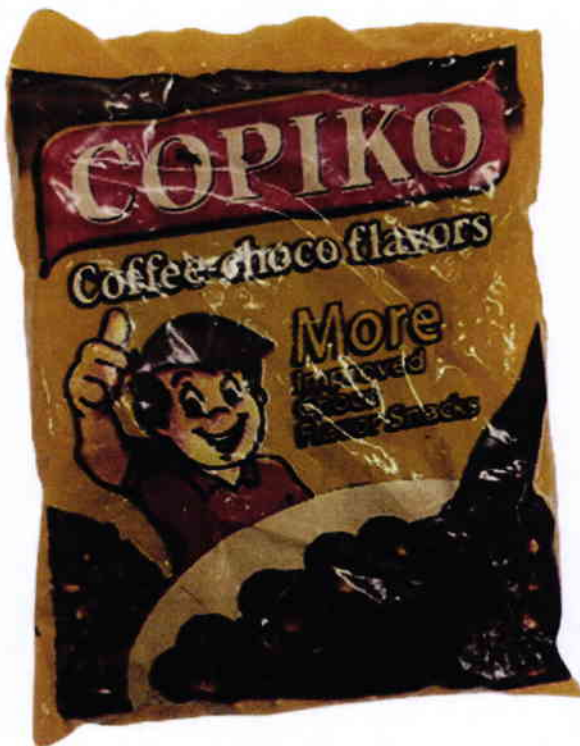
Figure 4. Unregistered COPIKO Coffee-choco flavors Snacks