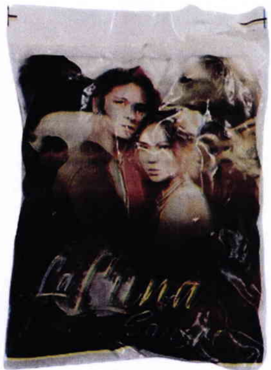
Figure 5. Unregistered LA LUNA SANGRE (product name not indicated)