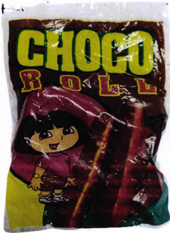
Figure 2. Unregistered (UNBRANDED) Choco Roll