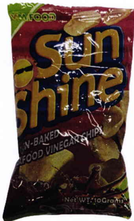
Figure 1. Unregistered WM FOOD Sunshine Oven-baked Seafood Vinegar Chips

The Food and Drug Administration (FDA) warns all healthcare professionals and the general public NOT TO PURCHASE AND CONSUME the following unregistered food products: