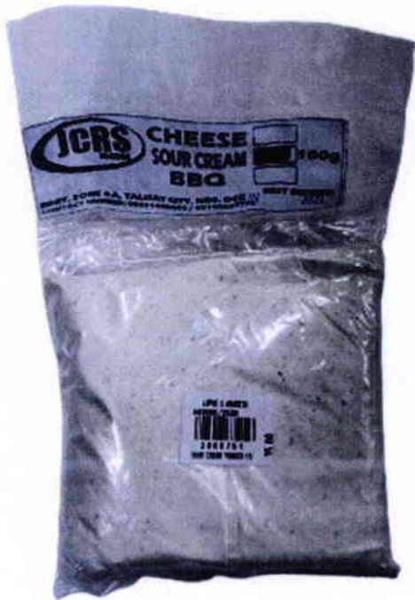
Figure 2. Unregistered JCRS Sour Cream Powder