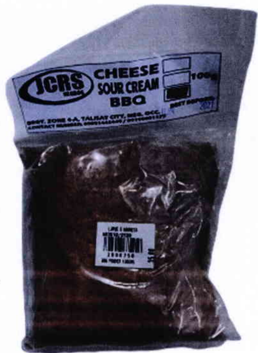
Figure 3. Unregistered JCRS BBQ Powder