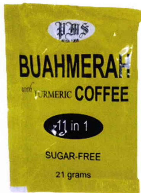
Figure 5. Unregistered PMS Buahmerah with Turmeric Coffee 11in1