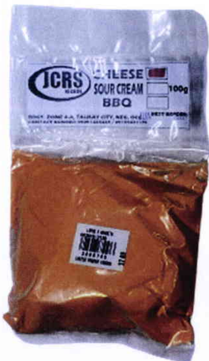
Figure 4. Unregistered JCRS Cheese Powder