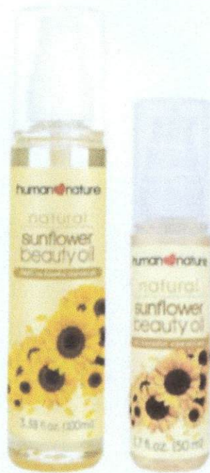
Figure 2. Authentic Human Nature 100% Natural Sunflower Beauty Oil