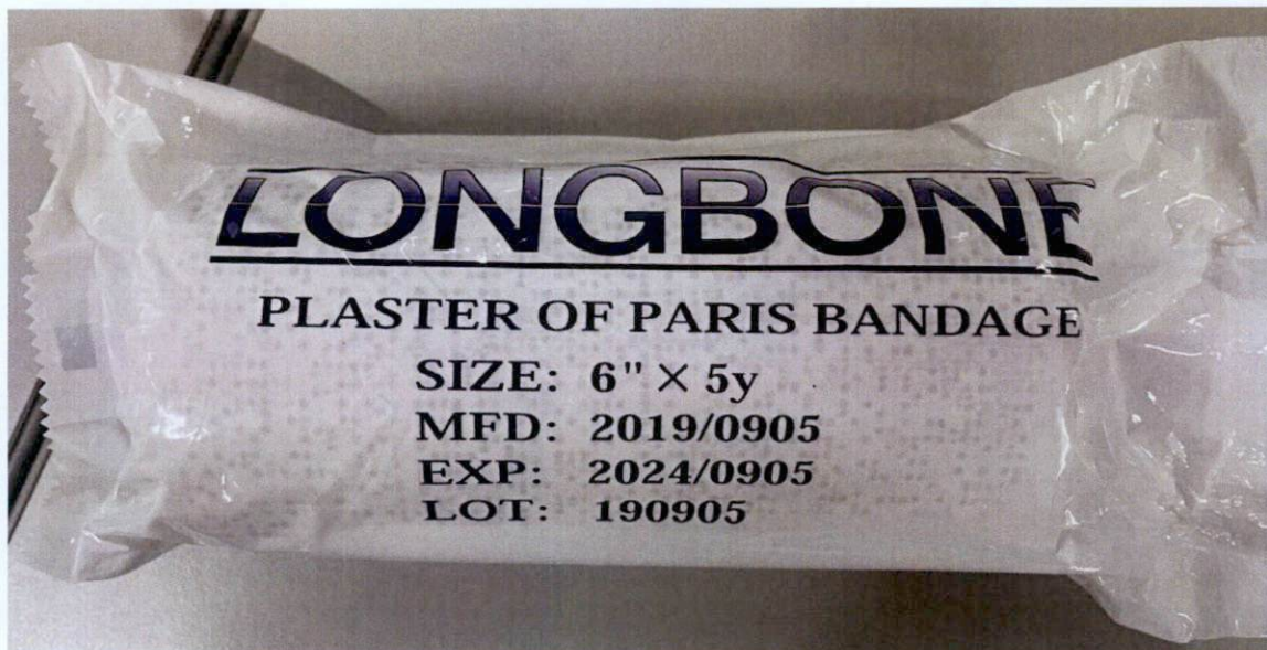
Figure 1. Unnotified Long Bone Plaster of Paris Bandage 6"x 5y

The Food and Drug Administration (FDA) warns all healthcare professionals and the general public NOT TO PURCHASE AND USE the unnotified medical device product: