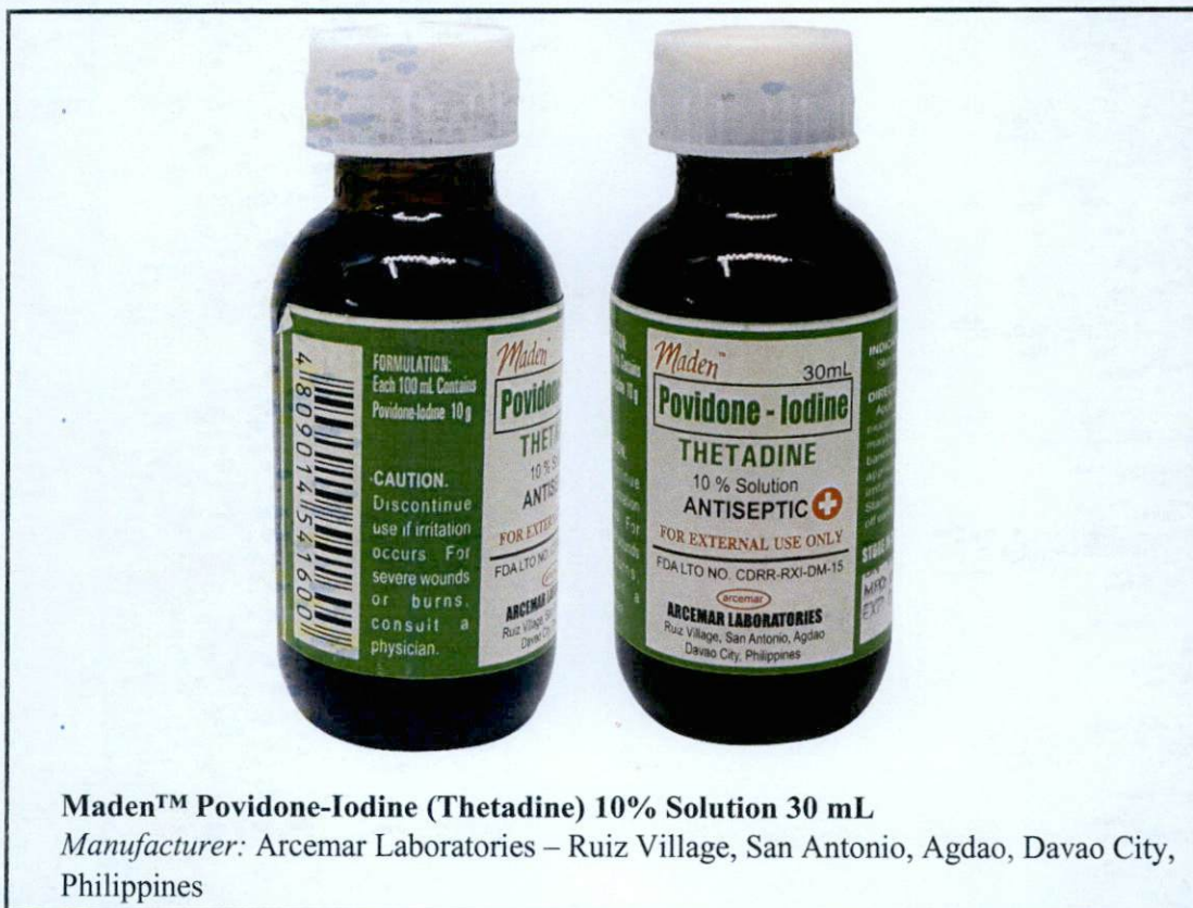
Figure 1. Unregistered drug product

The Food and Drug Administration (FDA) advises the public against the purchase and use of the unregistered drug product: