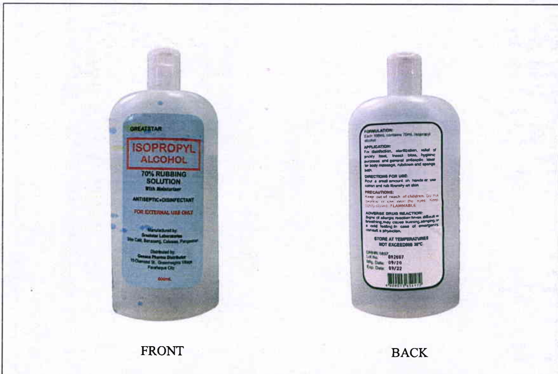
Figure 1. Isopropyl Alcohol 70% Rubbing Solution with Moisturizer for recall