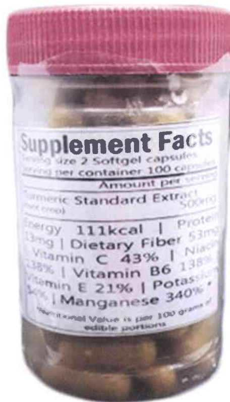
Turmeric 500 mg Capsule 100's