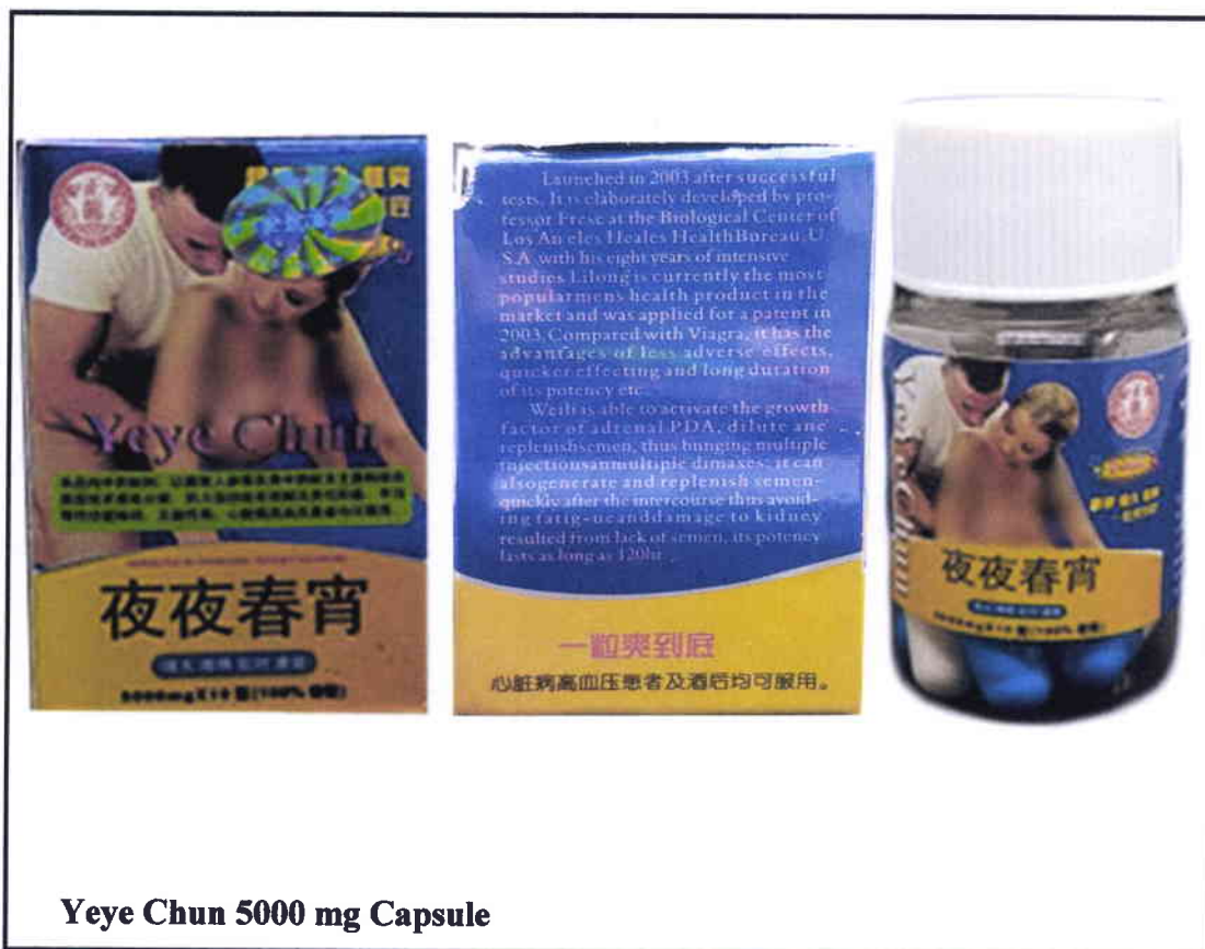
Yeye Chun 5000 mg Capsule

The Food and Drug Administration (FDA) advises the public against the purchase and use of the following unregistered drug products: