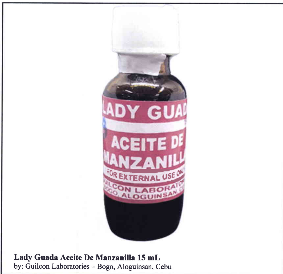
Lady Guada Aceite De Manzanilla 15 mL by: Guilcon Laboratories – Bogo, Aloguinsan, Cebu

The Food and Drug Administration (FDA) advises the public against the purchase and use of the following unregistered drug products: