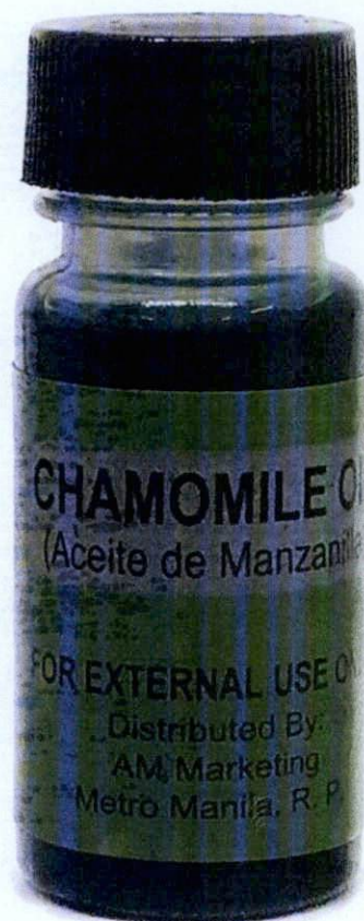
Chamomile Oil (Aceite de Manzanilla) Distributed by: AM Marketing - Metro Manila, R.P

The Food and Drug Administration (FDA) advises the public against the purchase and use of the unregistered drug product: