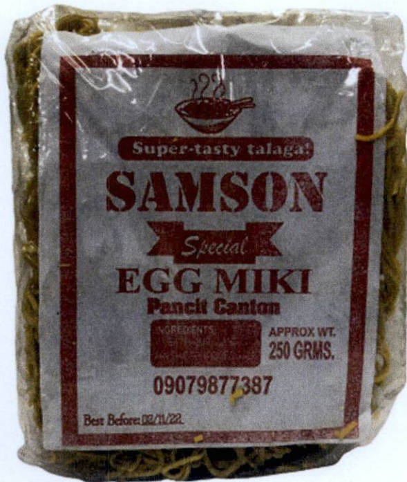
Figure 4. Unregistered SAMSON Special Egg Miki Pancit Canton