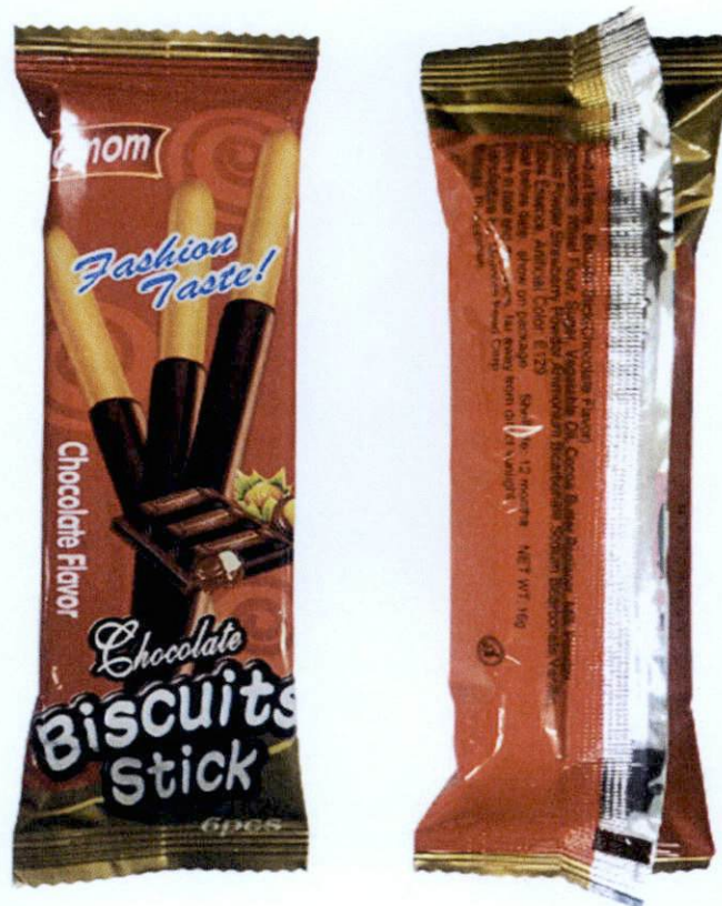
Figure 1. Unregistered MOMOM Chocolate Biscuit Sticks – Chocolate Flavor

The Food and Drug Administration (FDA) warns all healthcare professionals and the general public NOT TO PURCHASE AND CONSUME the following unregistered food products: