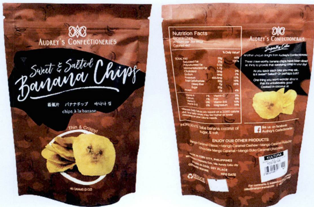
Figure 3. Unregistered AUDREY'S CONFECTIONERIES Sweet & Salted Banana Chips