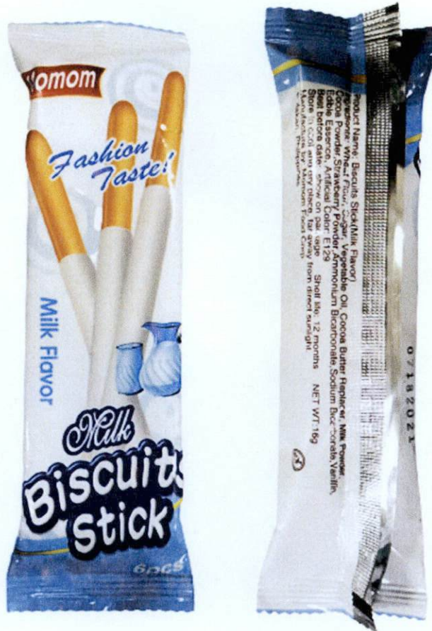
Figure 2. Unregistered MOMOM Chocolate Biscuit Sticks – Milk Flavor