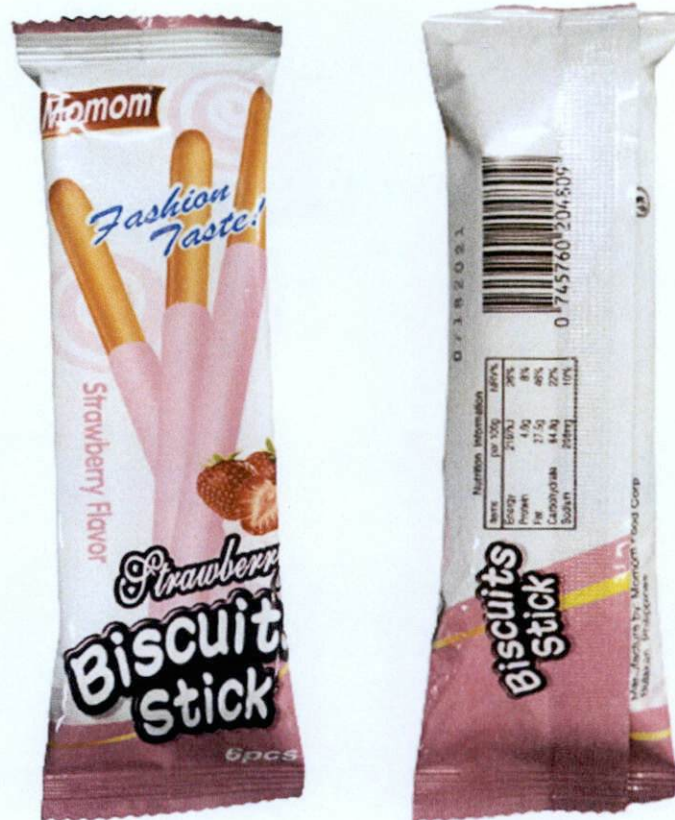
Figure 5. Unregistered MOMOM Strawberry Biscuit Sticks – Strawberry Flavor

The FDA verified through online monitoring or post-marketing surveillance that the abovementioned food products are not registered and no corresponding Certificates of Product Registration (CPR) have been issued. Pursuant to the Republic Act No. 9711, otherwise known as the “Food and Drug Administration Act of 2009”, the manufacture, importation, exportation, sale, offering for sale, distribution, transfer, non-consumer use, promotion, advertising or sponsorship of health products without the proper authorization is prohibited.