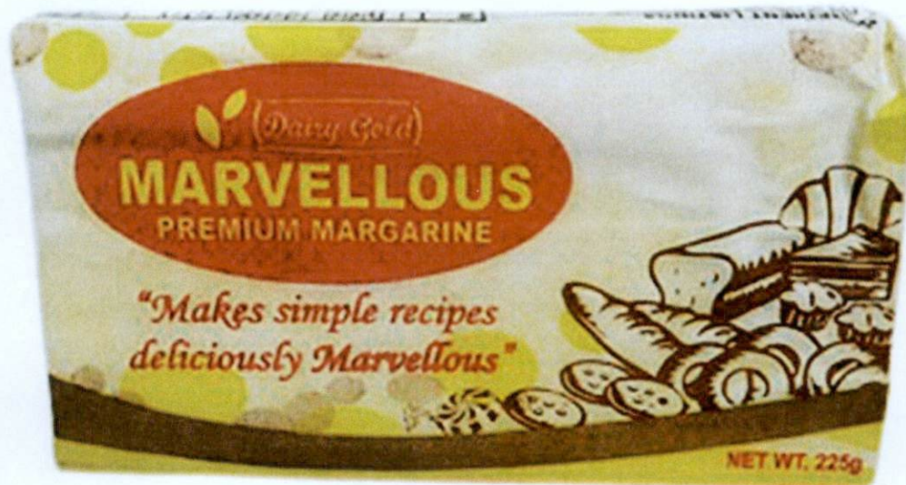
Figure 1. Unregistered DAIRY GOLD MARVELLOUS Premium Margarine

The Food and Drug Administration (FDA) warns all healthcare professionals and the general public NOT TO PURCHASE AND CONSUME the following unregistered food products: