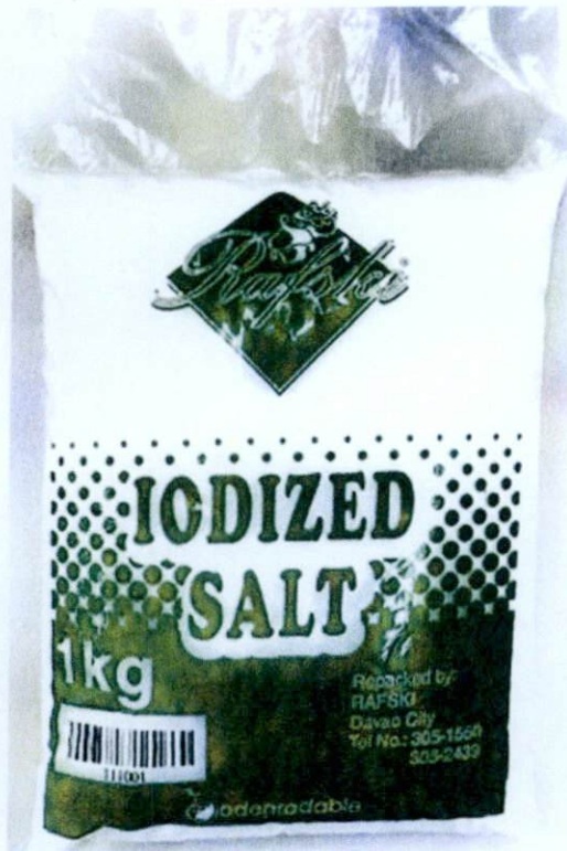
Figure 2. Unregistered RAFSKI Iodized Salt