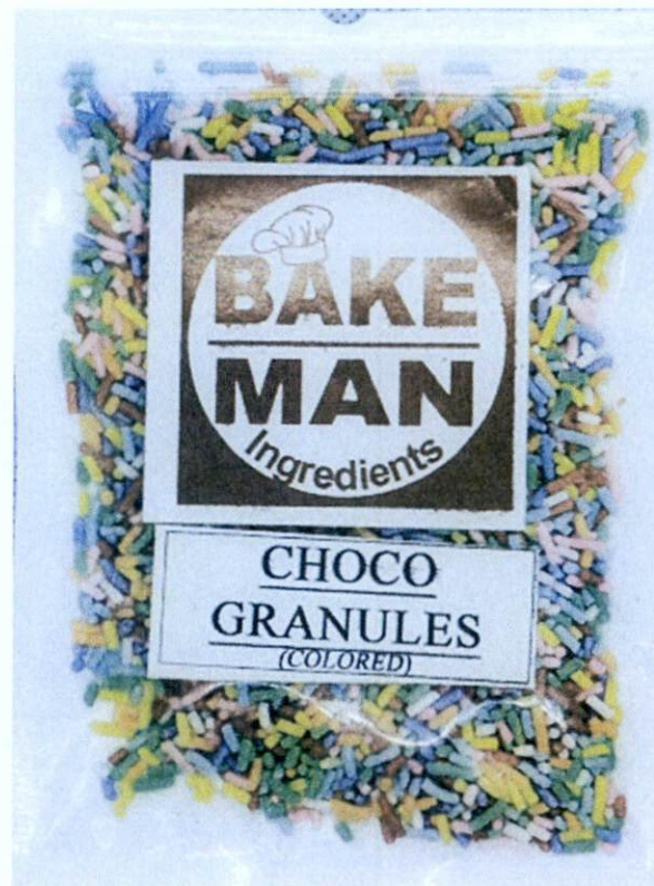
Figure 4. Unregistered BAKE MAN INGREDIENTS Choco Granules (Colored)