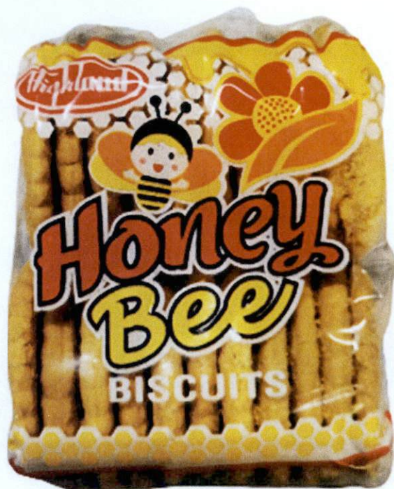
Figure 2. Unregistered HIGHLAND Honey Bee Biscuits