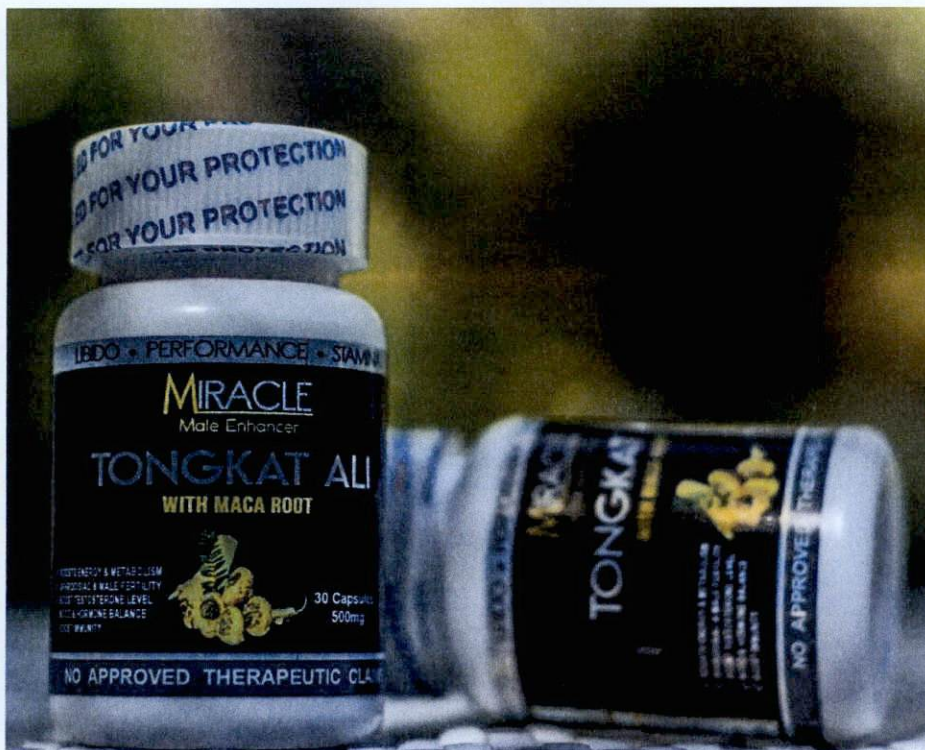
Figure 5. Unregistered MIRACLE Tongkat Ali with Maca Root Food Supplement