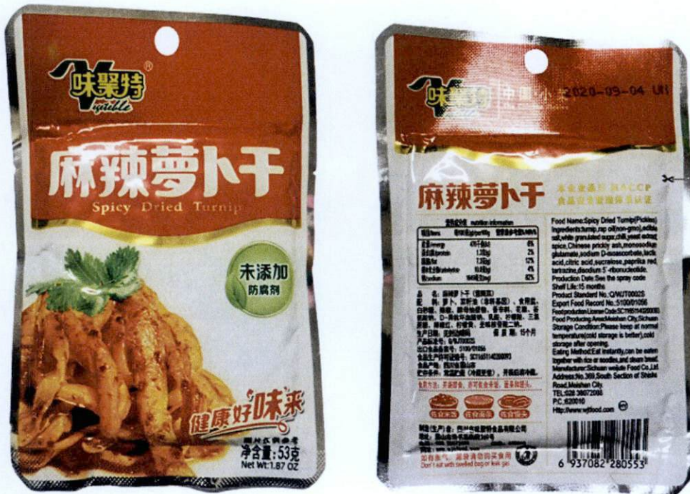
Figure 1. Unregistered VEGETABLE Spicy Dried Turnip Pickles (In Foreign Language)

The Food and Drug Administration (FDA) warns all healthcare professionals and the general public NOT TO PURCHASE AND CONSUME the following unregistered food products and food supplements: