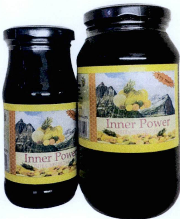
Figure 3. Unregistered INNER POWER The Healthiest Fruit Jam