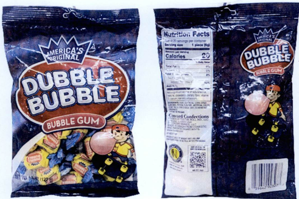
Figure 3. Unregistered AMERICA'S ORIGINAL DUBBLE BUBBLE Bubble Gum