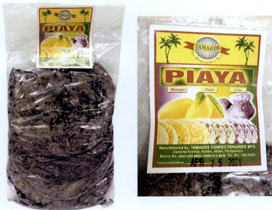
Figure 2. Unregistered TAMAGOS Ube Piaya