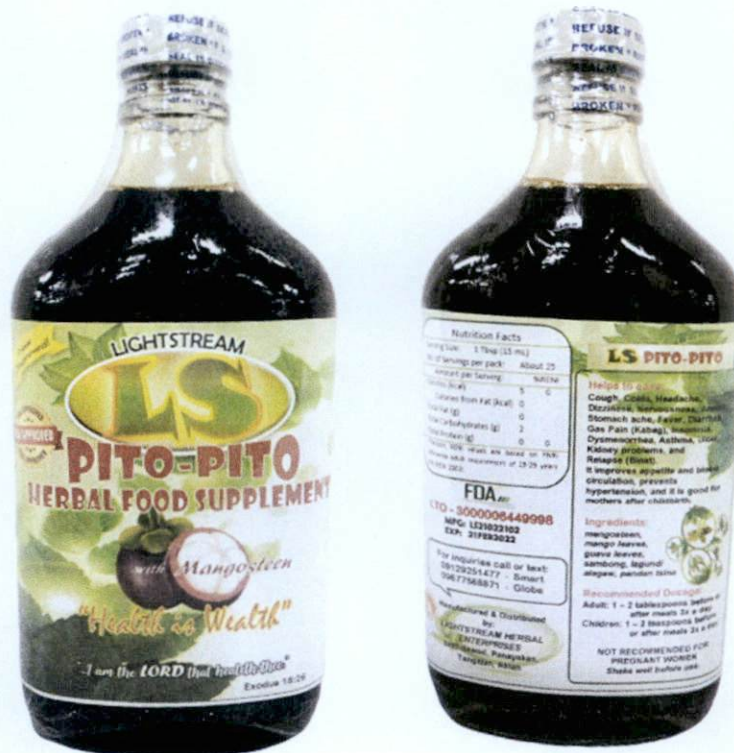
Figure 1. Unregistered LIGHTSTREAM LS Pito-Pito Herbal Food Supplement with Mangosteen

The Food and Drug Administration (FDA) warns all healthcare professionals and the general public NOT TO PURCHASE AND CONSUME the following unregistered food products: