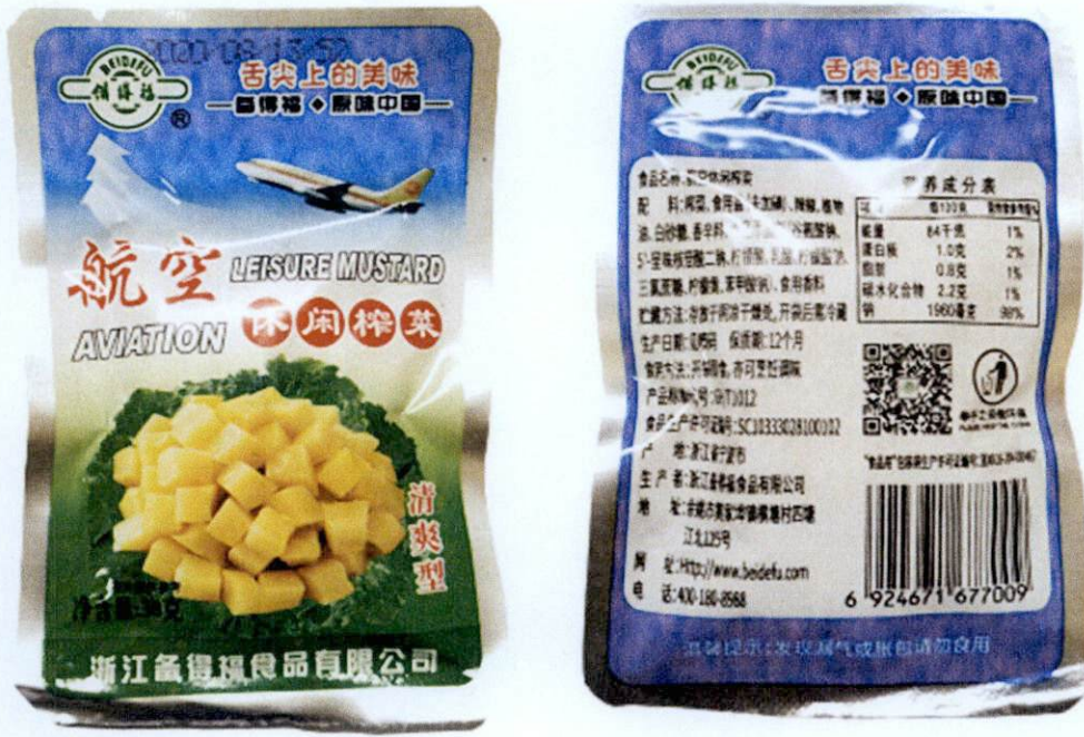
Figure 4. Unregistered BEIDEFU AVIATION Leisure Mustard (In Foreign Language)