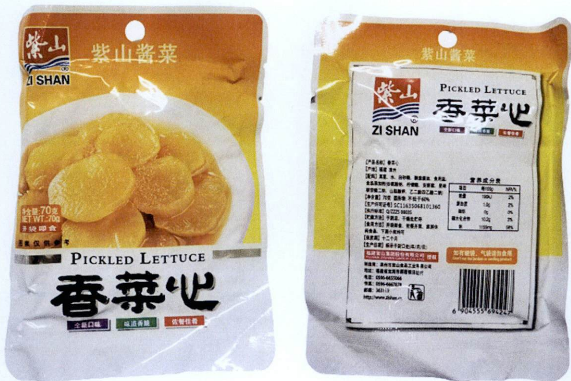
Figure 5. Unregistered ZI SHAN Pickled Lettuce (In Foreign Language)