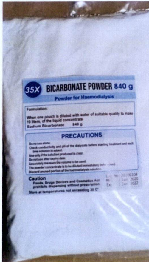
Figure 3. Unregistered BICARBONATE POWDER Powder for Haemodialysis