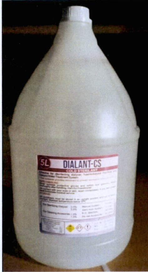
Figure 2. Unregistered Dialant-CS Cold Sterilant 5L