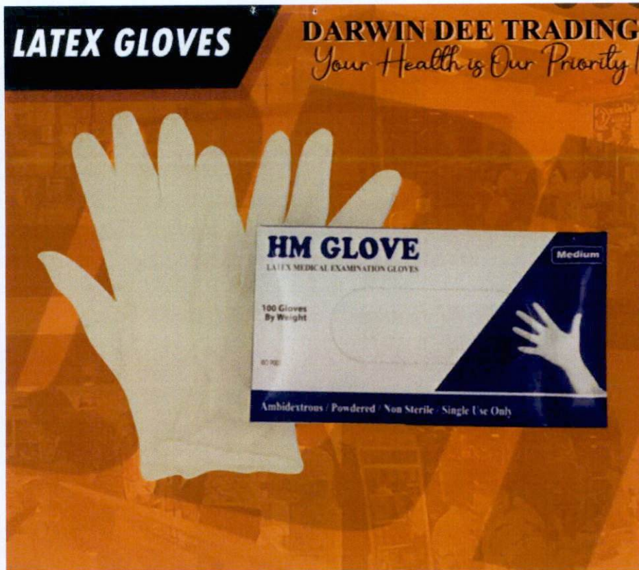
Figure 2. Unnotified HM Glove Latex Medical Examination Gloves - Ambidextrous Powdered Non-Sterile Single Use Only