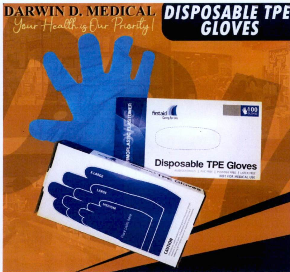
Figure 3. Unnotified Firstaid Thermoplastic Elastomer Disposable Tpe Gloves – Ambidextrous/Pvc Free/Powder Free/ Latex Free