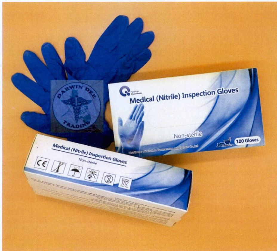
Figure 1. Unnotified Fusion Quantum Medical (Nitrile) Examination Gloves

The Food and Drug Administration (FDA) warns all healthcare professionals and the general public NOT TO PURCHASE AND USE the unnotified medical device products: