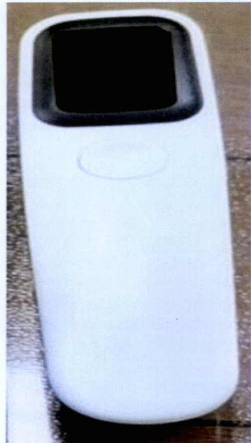
Figure 1. Unregistered BBLOVE Infrared Thermometer