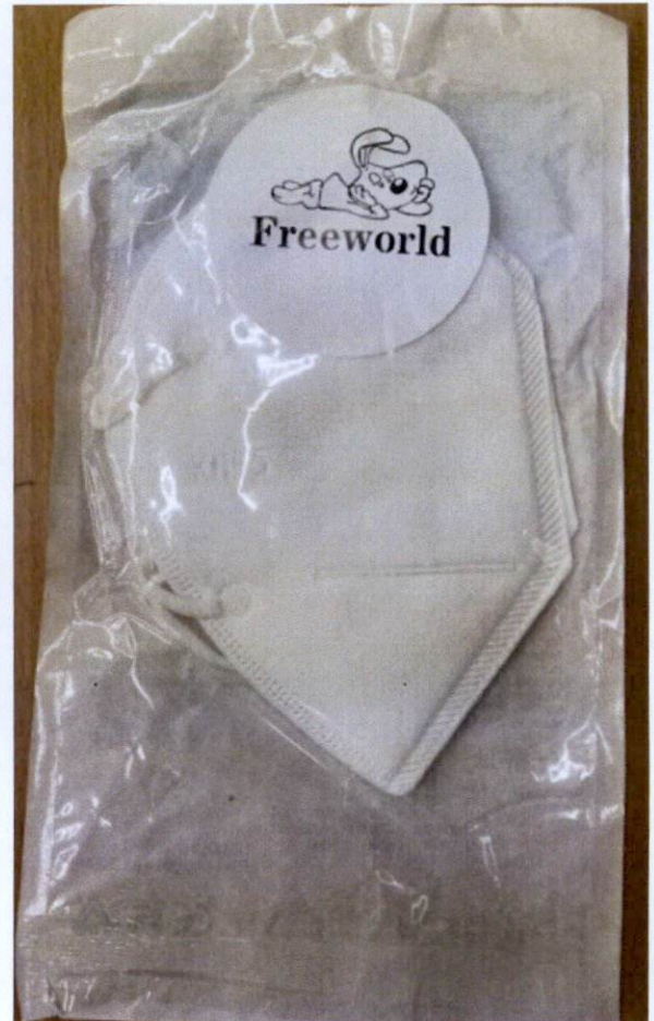
Figure 1. Unnotified Freeworld KN95 High Efficiency Protective Mask