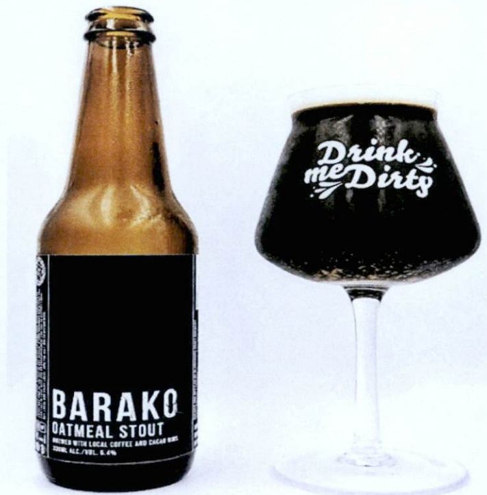
Figure 3. Unregistered BARAKO Oatmeal Stout Brewed with Local Coffee and Cacao Nibs