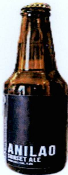
Figure 5. Unregistered ANILAO Sunset Ale