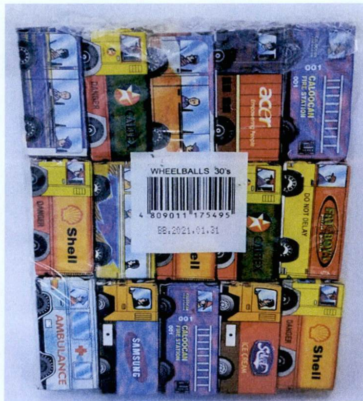
Figure 1. Unregistered (UNBRANDED) Wheelballs, 30's

The Food and Drug Administration (FDA) warns all healthcare professionals and the general public NOT TO PURCHASE AND CONSUME the following unregistered food products: