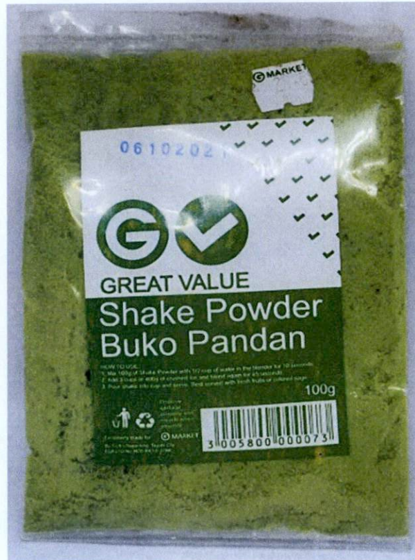
Figure 2. Unregistered GREAT VALUE Shake Powder Buko Pandan, 100g