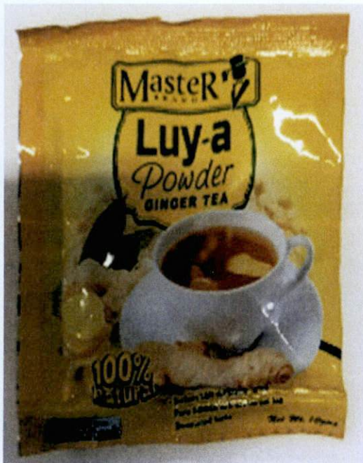
Figure 3. Unregistered MASTER BRAND Luy-A Powder Ginger Tea, Net Wt. 10gms.