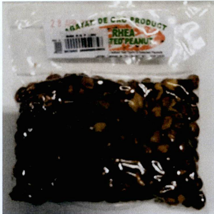
Figure 2. Unregistered RHEA Salted Peanut, 130g