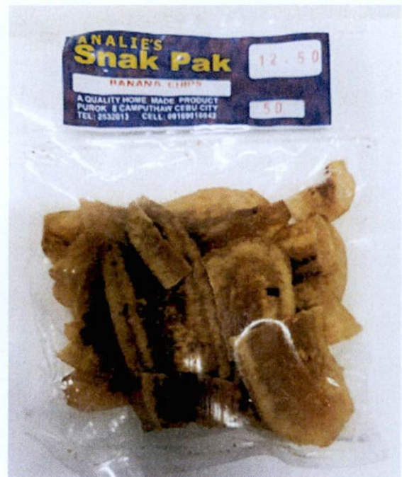
Figure 4. Unregistered ANALIE'S Snak Pak Banana Chip