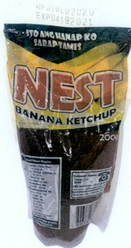
Figure 5. Unregistered NEST Banana Ketchup