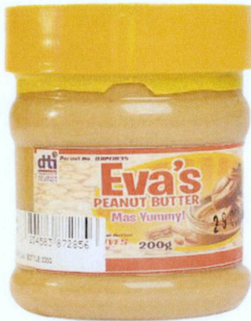
Figure 4. Unregistered EVA'S Peanut Butter