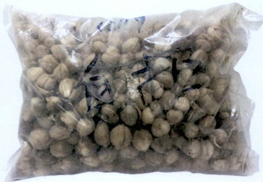
Figure 3. Unregistered Dried Flower-Like Product (No Label)