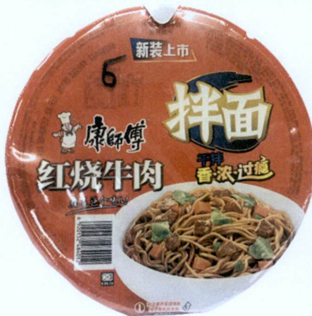
Figure 1. Unregistered Instant Noodle in Red Round Container (In Foreign Language)

The Food and Drug Administration (FDA) warns all healthcare professionals and the general public NOT TO PURCHASE AND CONSUME the following unregistered food products: