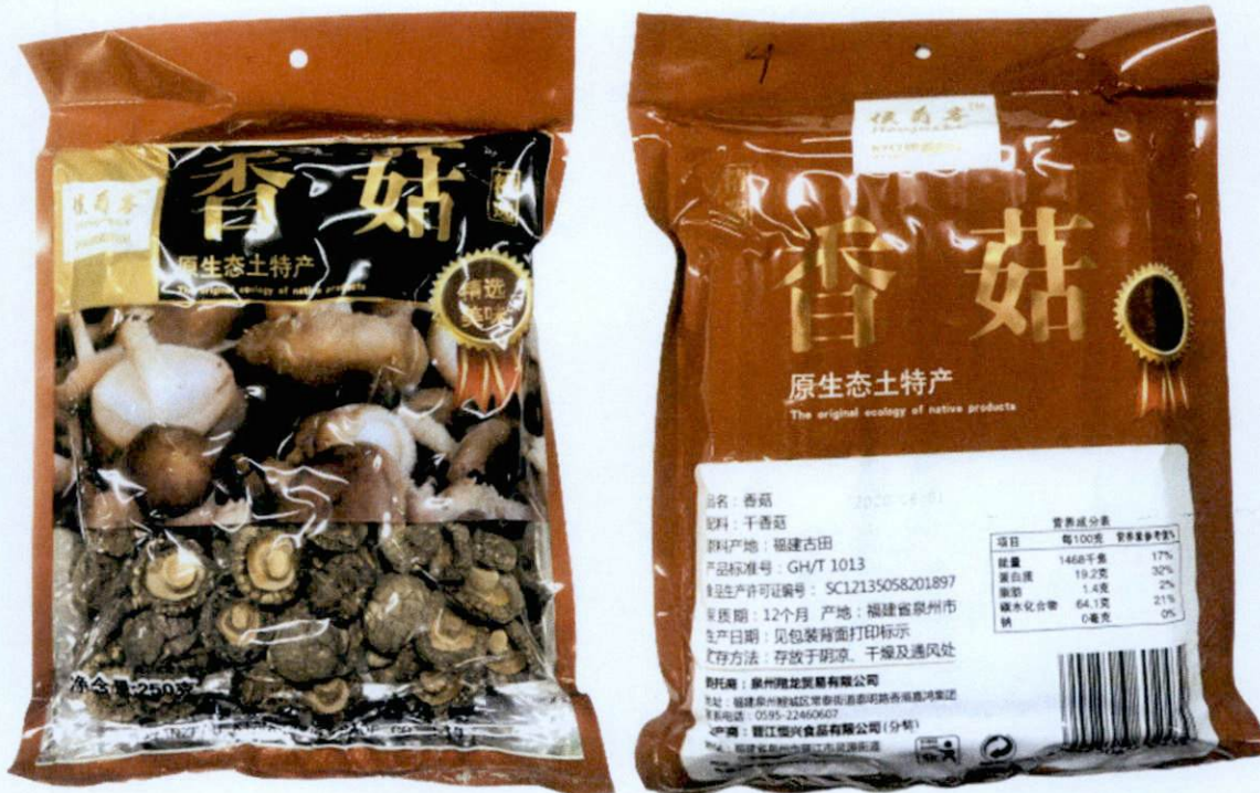
Figure 2. Unregistered HOUJUEKE The Original Ecology of Native Products in Brown Packaging (In Foreign Language)