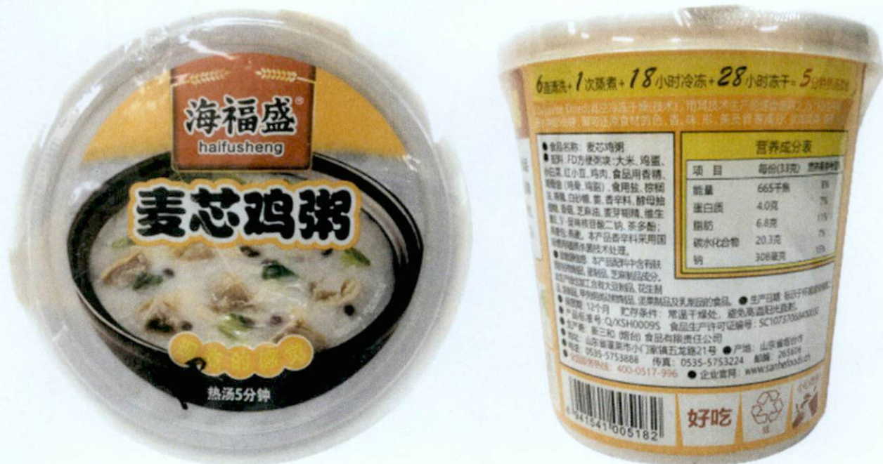
Figure 4. Unregistered HAIFUSHENG Instant Porridge in Orange Paper Cup (In Foreign Language)