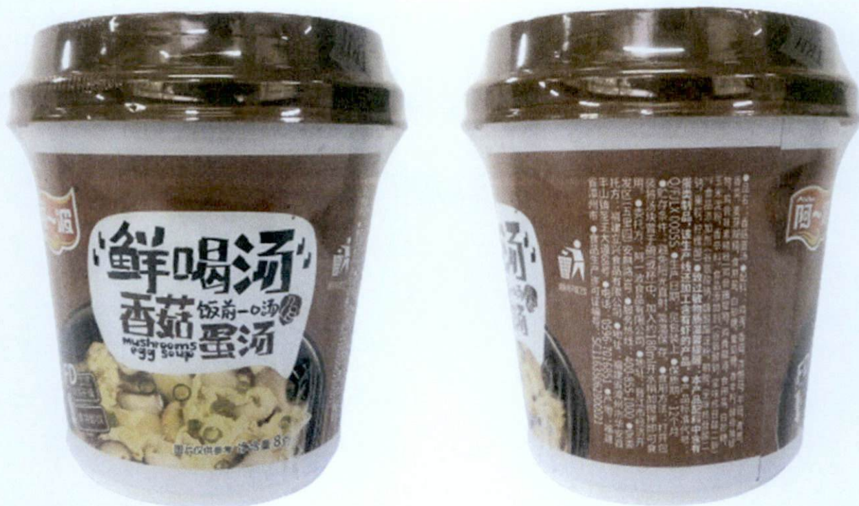
Figure 3. Unregistered AVIBO Mushrooms Egg Soup (In Foreign Language)