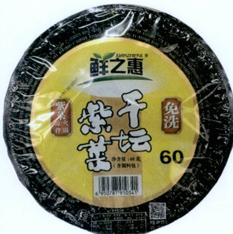
Figure 5. Unregistered XIANZHUIHUI Dried Seaweed in Round Black Container (In Foreign Language)