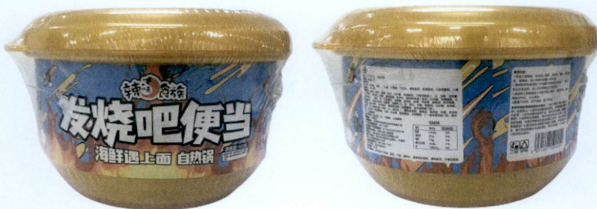
Figure 1. Unregistered LAWWEISHIZU Food Product in Gold Container (In Foreign Language)

The Food and Drug Administration (FDA) warns all healthcare professionals and the general public NOT TO PURCHASE AND CONSUME the following unregistered food products: