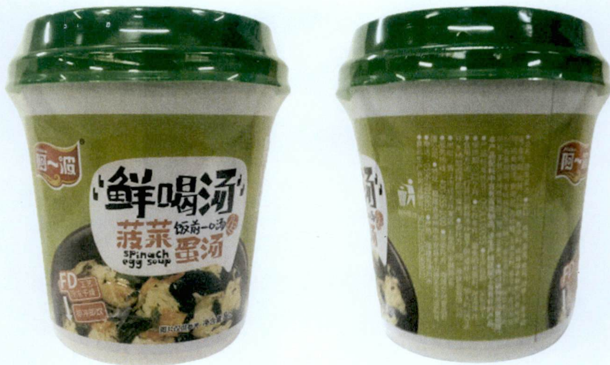
Figure 2. Unregistered AVIBO Spinach Egg Soup (In Foreign Language)