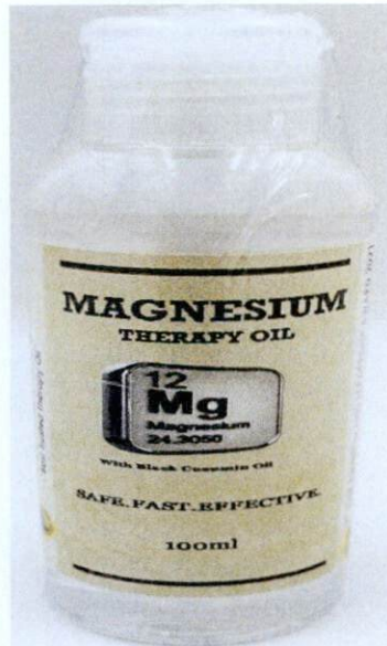
Figure 2. Unregistered (UNBRANDED) Magnesium Therapy Oil with Black Cumin Oil Food Supplement, 100ml