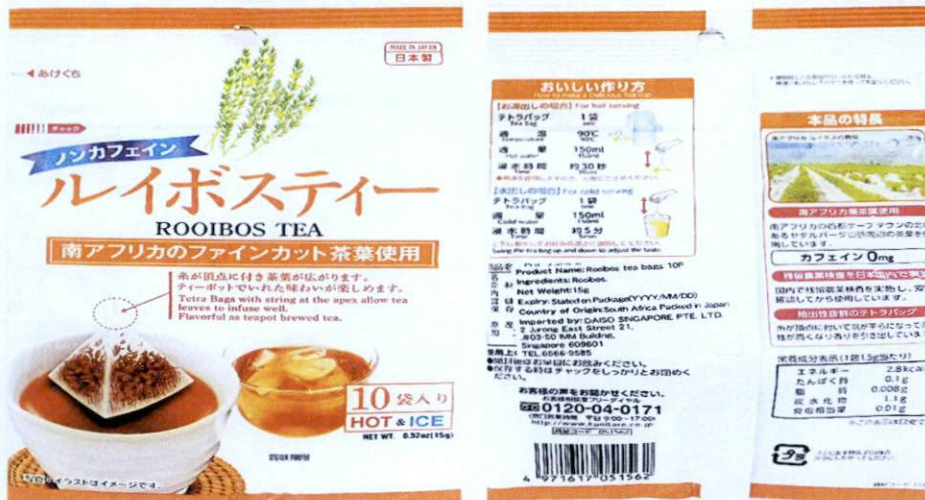
Figure 4. Unregistered ROOIBOS Tea (in White Packaging with Orange lining), Net Wt. 15g (0.52oz) (Labels are in foreign language)