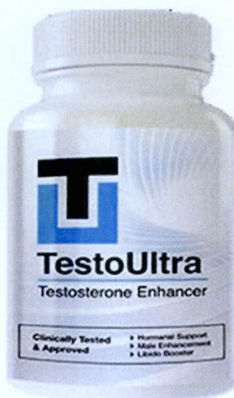
Figure 1. Unregistered TESTOULTRA Testosterone Enhancer

The Food and Drug Administration (FDA) warns all healthcare professionals and the general public NOT TO PURCHASE AND CONSUME the following unregistered food supplements and food products: