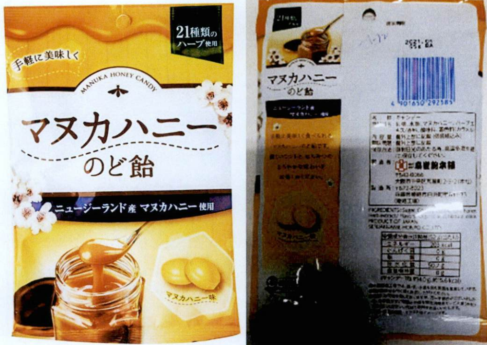
Figure 5. Unregistered MANUKA Honey Candy (in White and Yellow Packaging) (Labels are in foreign language)

The FDA verified through online monitoring or post-marketing surveillance that the abovementioned food supplements and food products are not registered and no corresponding Certificates of Product Registration (CPR) have been issued. Pursuant to the Republic Act No. 9711, otherwise known as the “Food and Drug Administration Act of 2009”, the manufacture, importation, exportation, sale, offering for sale, distribution, transfer, non-consumer use, promotion, advertising or sponsorship of health products without the proper authorization is prohibited.