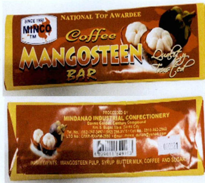
Figure 2. Unregistered MINCO Coffee Mangosteen Bar