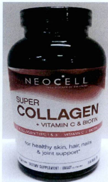
Figure 1. Unregistered NEOCELL Super Collagen + Vitamin C & Biotin (Collagen Type 1 & 3) 6g Collagen Dietary Supplement, 360 Tablets

The Food and Drug Administration (FDA) warns all healthcare professionals and the general public NOT TO PURCHASE AND CONSUME the following unregistered food supplement and food products: