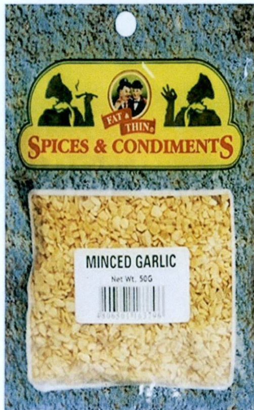
Figure 3. Unregistered FAT & THIN SPICES & CONDIMENTS Minced Garlic, Net Wt. 50g