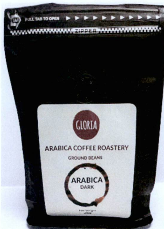
Figure 4. Unregistered GLORIA Arabica Coffee Roastery Ground Beans – Arabica Dark, Net Wt. 200g