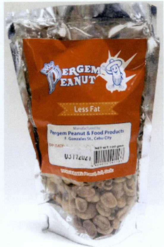
Figure 3. Unregistered PERGEM Peanut Less Fat, Net Wt. 100g