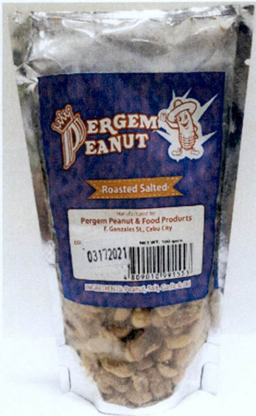
Figure 2. Unregistered PERGEM Peanut Roasted Salted, Net Wt. 100g