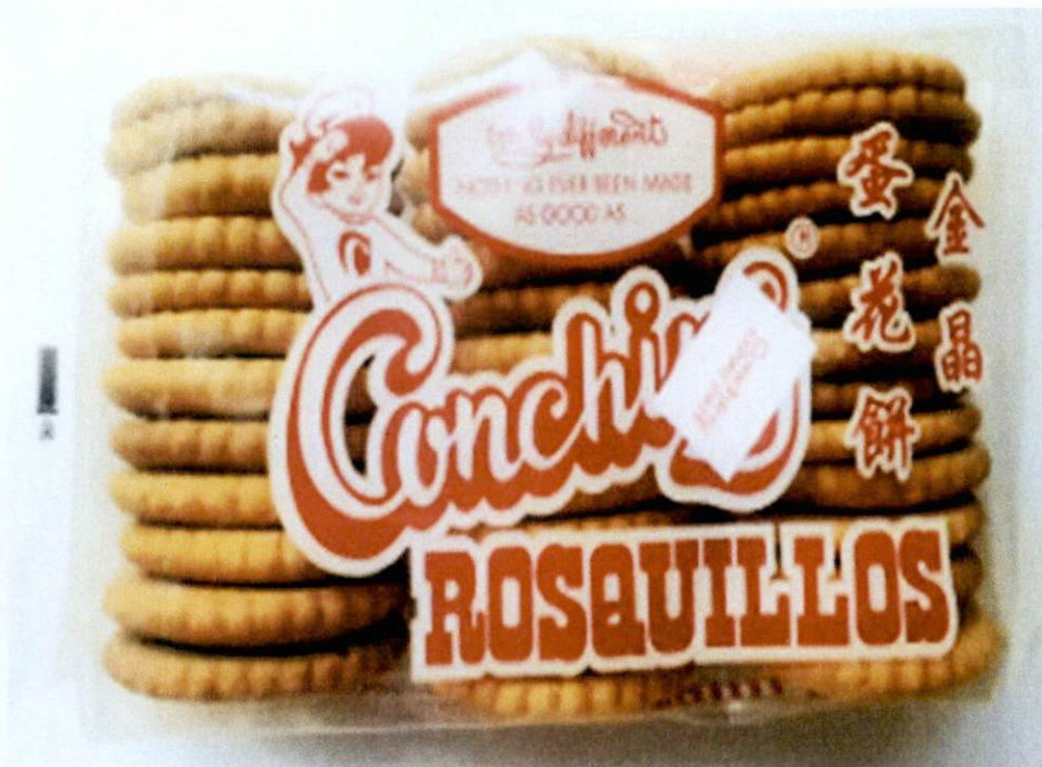
Figure 5. Unregistered CONCHING Rosquillos, Approx. Wt. 190g (Small)

The FDA verified through online monitoring or post-marketing surveillance that the abovementioned food products are not registered and no corresponding Certificates of Product Registration (CPR) have been issued. Pursuant to the Republic Act No. 9711, otherwise known as the “Food and Drug Administration Act of 2009”, the manufacture, importation, exportation, sale, offering for sale, distribution, transfer, non-consumer use, promotion, advertising or sponsorship of health products without the proper authorization is prohibited.