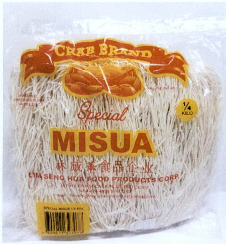
Figure 1. Unregistered CRAB BRAND Special Misua, ¼ Kilo

The Food and Drug Administration (FDA) warns all healthcare professionals and the general public NOT TO PURCHASE AND CONSUME the following unregistered food products: