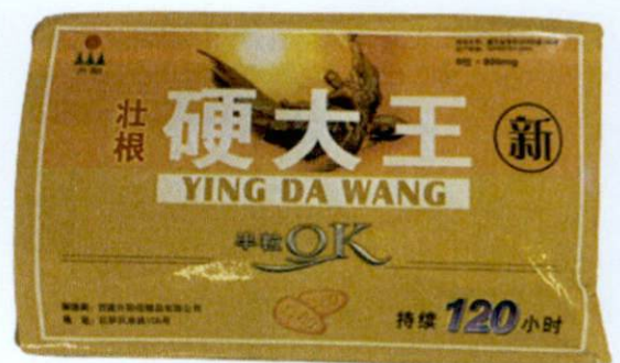
Figure 5. Unregistered YING DA WANG OK in Yellow-colored box (Labels are in foreign characters)