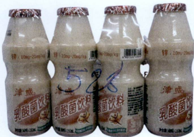
Figure 4. Unregistered 4-piece in a Pack Drink with Red-colored Labels (Labels are in foreign characters)