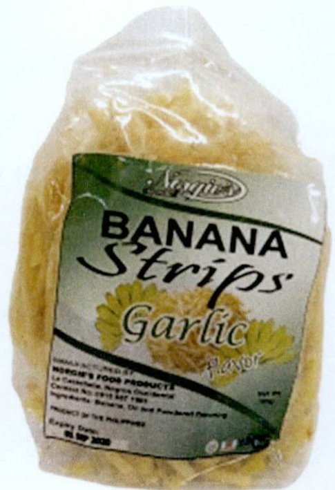
Figure 3. Unregistered NORGIE'S Banana Strips Garlic Flavor