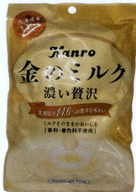
Figure 1. Unregistered KANRO Premium Milk Candy (Labels are in foreign characters)

The Food and Drug Administration (FDA) warns all healthcare professionals and the general public NOT TO PURCHASE AND CONSUME the following unregistered food products: