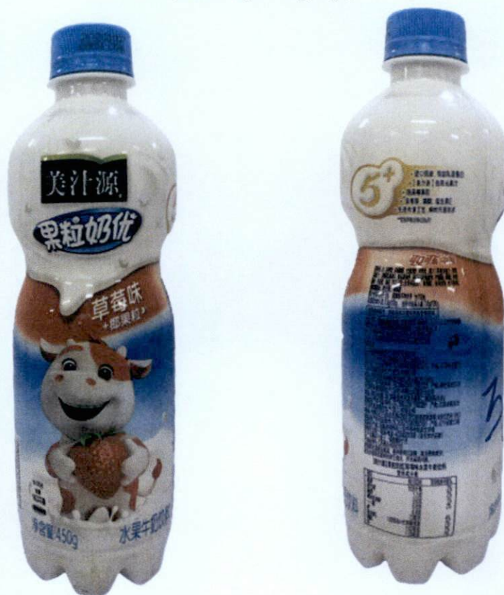
Figure 5. Unregistered Beverage with Cow and Strawberry Image in White PET Bottle (In Foreign Language)