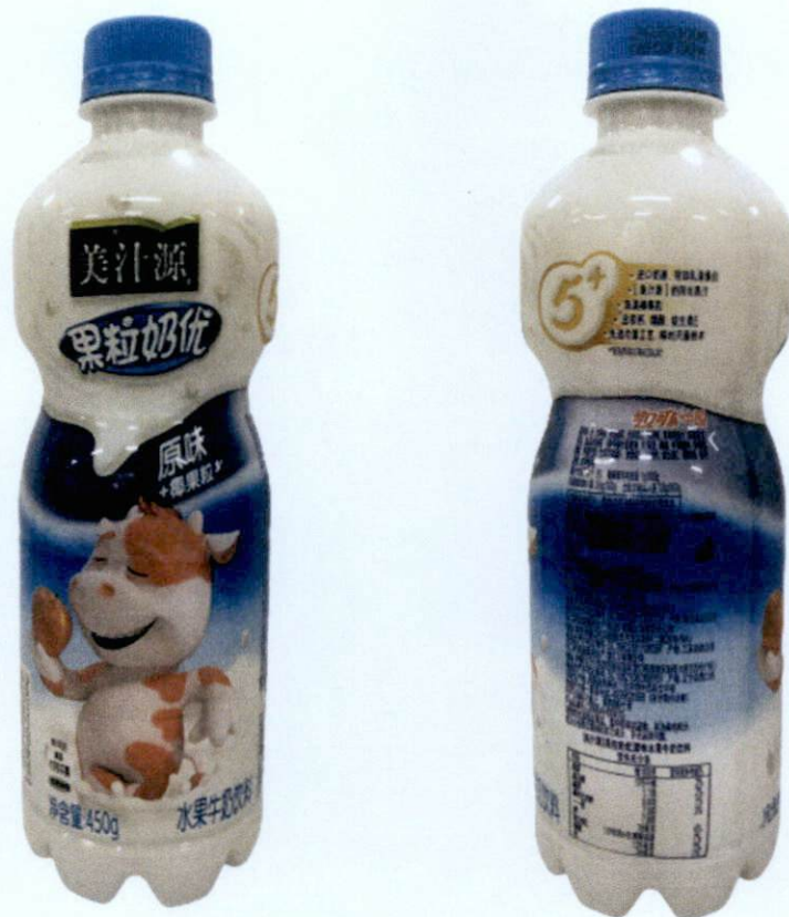
Figure 4. Unregistered Beverage with Cow and Apple Image in White PET Bottle (In Foreign Language)