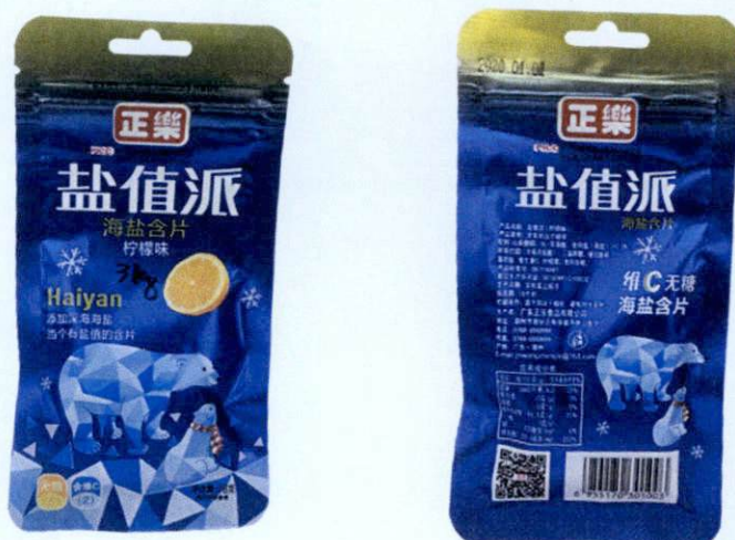
Figure 1. Unregistered HAIYAN with Orange and Polar Bear Image in Blue Packaging (In Foreign Language)

The Food and Drug Administration (FDA) warns all healthcare professionals and the general public NOT TO PURCHASE AND CONSUME the following unregistered food products: