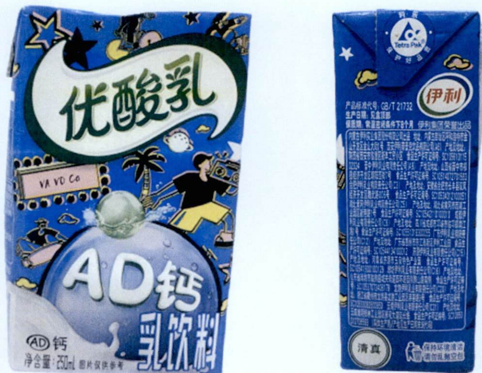
Figure 3. Unregistered VA VA CO AD Beverage in Blue Tetra Pak (In Foreign Language)