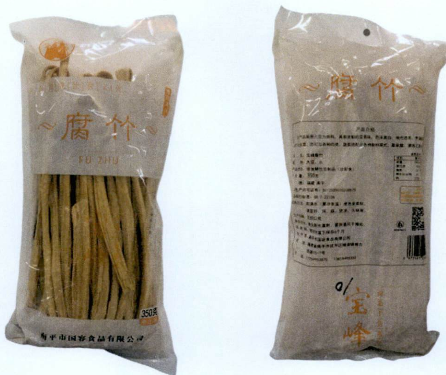
Figure 2. Unregistered FU ZHU Dried Food Product in White and Transparent Packaging (In Foreign Language)