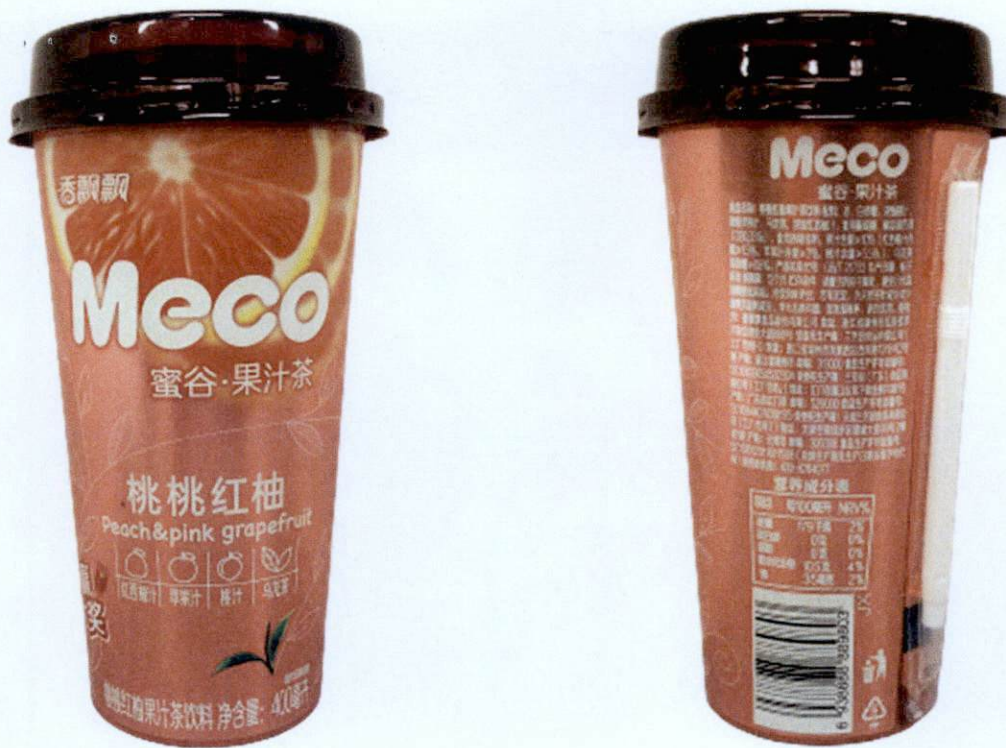
Figure 4. Unregistered MECO Peach & Pink Grapefruit in Pink Cup (In Foreign Language)