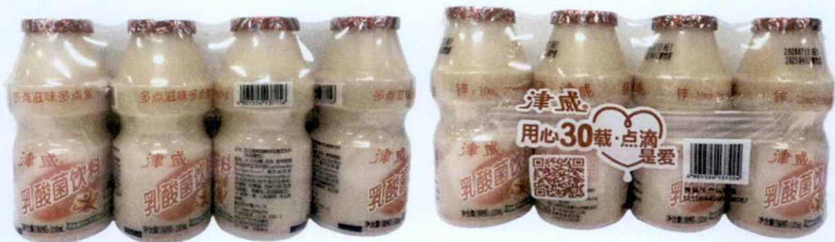
Figure 1. Unregistered Assumed Probiotic Beverage with Red Label in Transparent Bottle (In Foreign Language)

The Food and Drug Administration (FDA) warns all healthcare professionals and the general public NOT TO PURCHASE AND CONSUME the following unregistered food products: