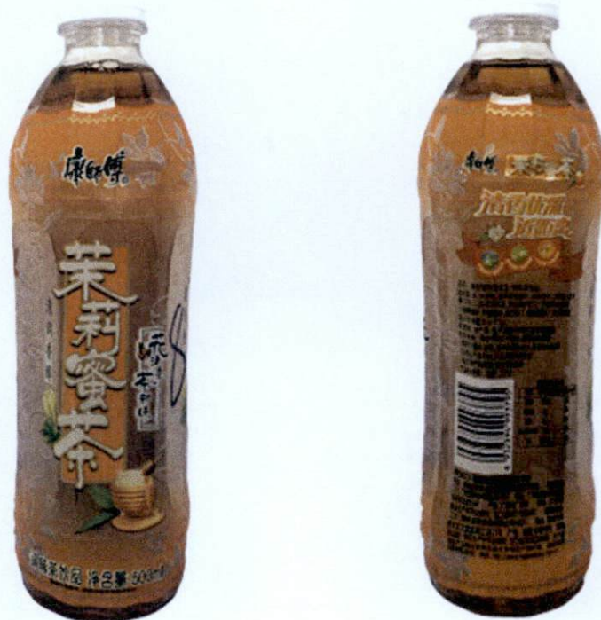
Figure 5. Unregistered Beverage with Honey Image in Orange PET Bottle (In Foreign Language)