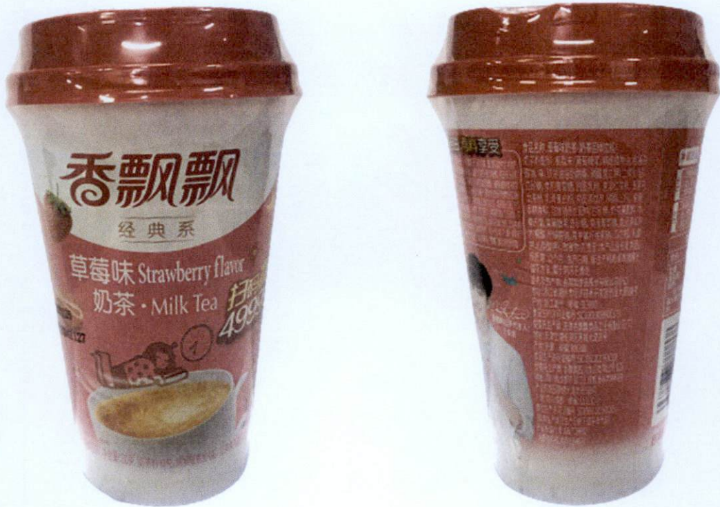
Figure 3. Unregistered Strawberry Flavor Milk Tea in Pink and White Paper Cup (In Foreign Language)