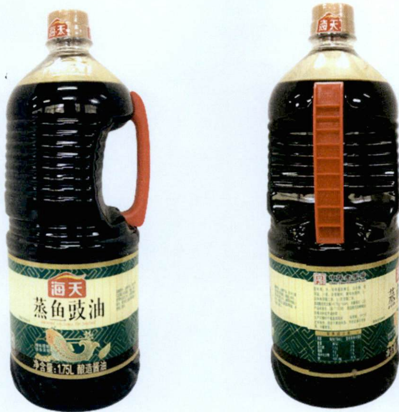
Figure 4. Unregistered CHINA TIME-HONORED BRAND Seasoned Soy Sauce for Seafood in Green and Light-Yellow PET Bottle (In Foreign Language)