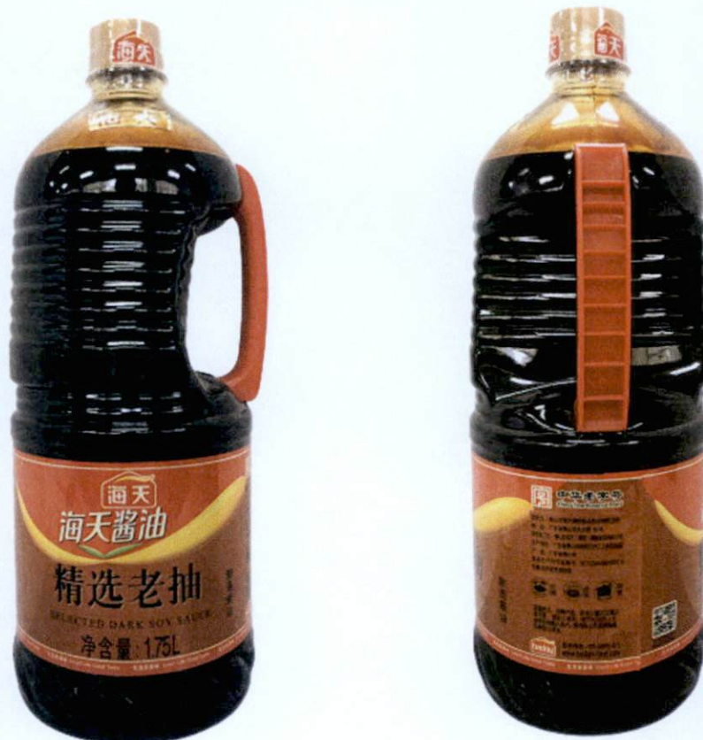
Figure 3. Unregistered CHINA TIME-HONORED BRAND Selected Dark Soy Sauce in Red and Brown PET Bottle (In Foreign Language)