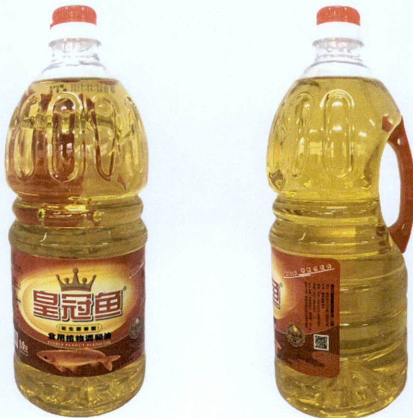
Figure 5. Unregistered Edible Peanut Blend Oil in Red PET Bottle (In Foreign Language)