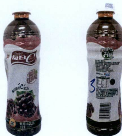
Figure 1. Unregistered DAILY C Beverage with Grapes Image in White and Violet Pet Bottle (In Foreign Language)

The Food and Drug Administration (FDA) warns all healthcare professionals and the general public NOT TO PURCHASE AND CONSUME the following unregistered food products: