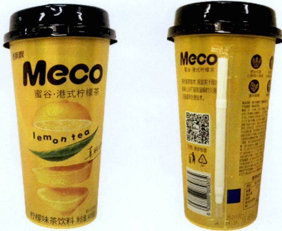
Figure 2. Unregistered MECO Lemon Tea in Yellow Cup (In Foreign Language)