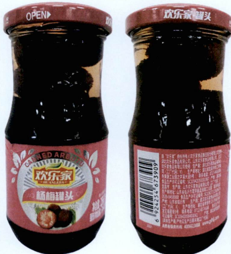
Figure 1. Unregistered HUANLEJIA Canned Arbutu with Pink Label in Glass Jar (In Foreign Language)

The Food and Drug Administration (FDA) warns all healthcare professionals and the general public NOT TO PURCHASE AND CONSUME the following unregistered food products: