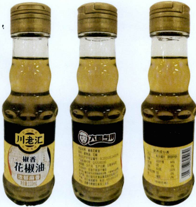
Figure 2. Unregistered Oil-like Product in Glass Bottle (In Foreign Language)