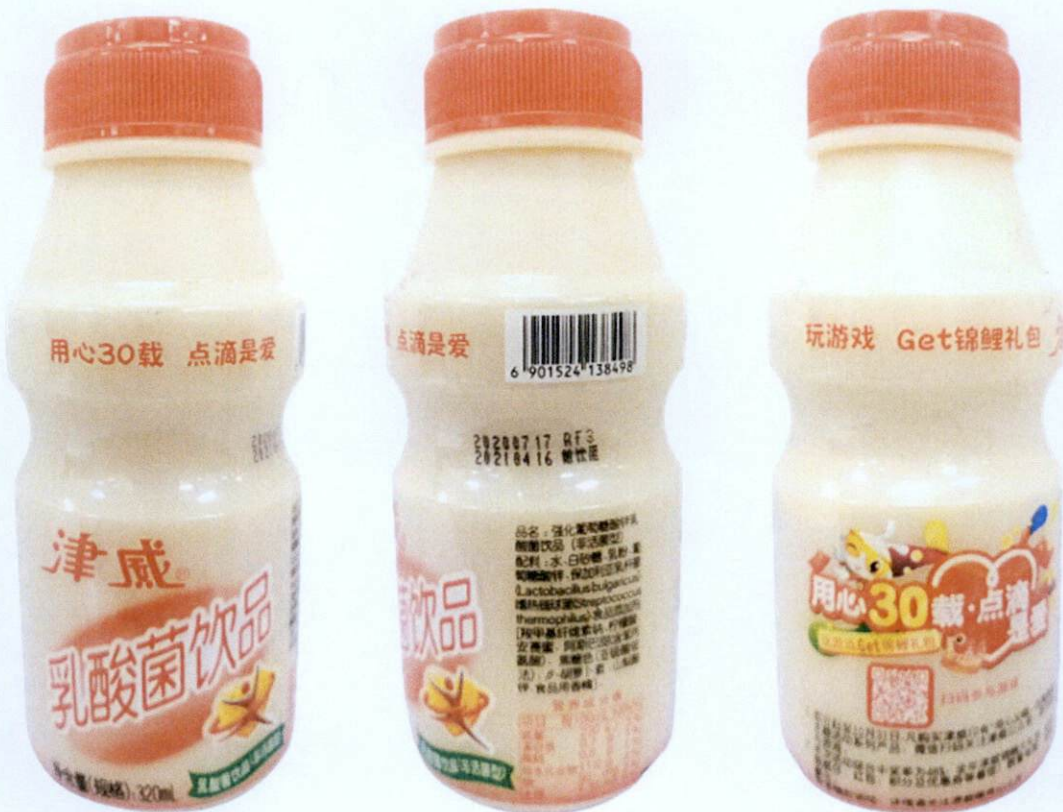
Figure 3. Unregistered Milk-like Drink with Red Cap in Plastic Bottle (In Foreign Language)