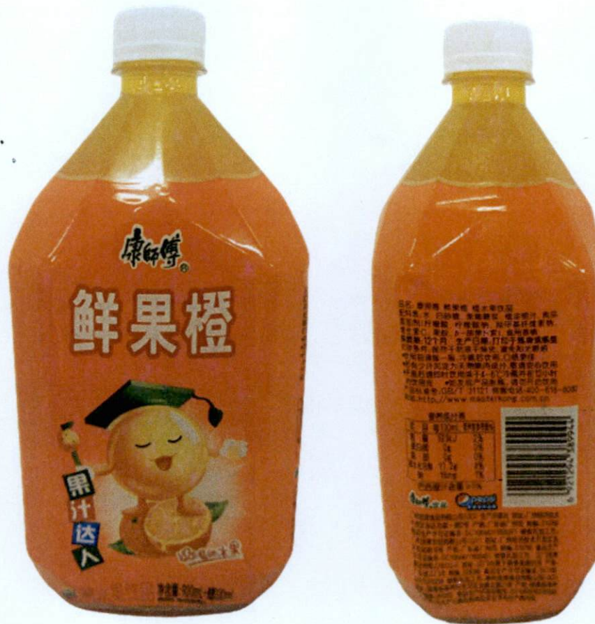
Figure 2. Unregistered Orange Juice Drink in PET Bottle (In Foreign Language)