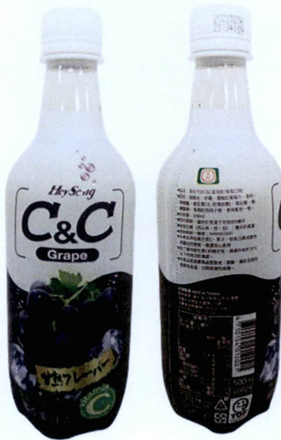
Figure 3. Unregistered HEYSONG C&C Grape Drink in PET Bottle (In Foreign Language)