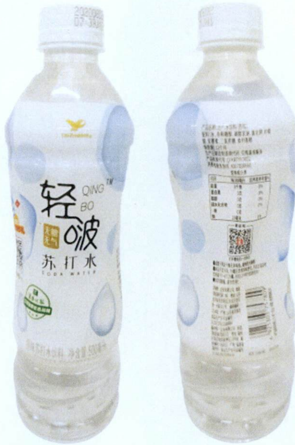
Figure 4. Unregistered UNI-PRESIDENT QING BO Soda Water (In Foreign Language)