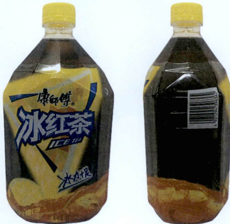
Figure 1. Unregistered Lemon Ice Tea in PET Bottle (In Foreign Language)

The Food and Drug Administration (FDA) warns all healthcare professionals and the general public NOT TO PURCHASE AND CONSUME the following unregistered food products: