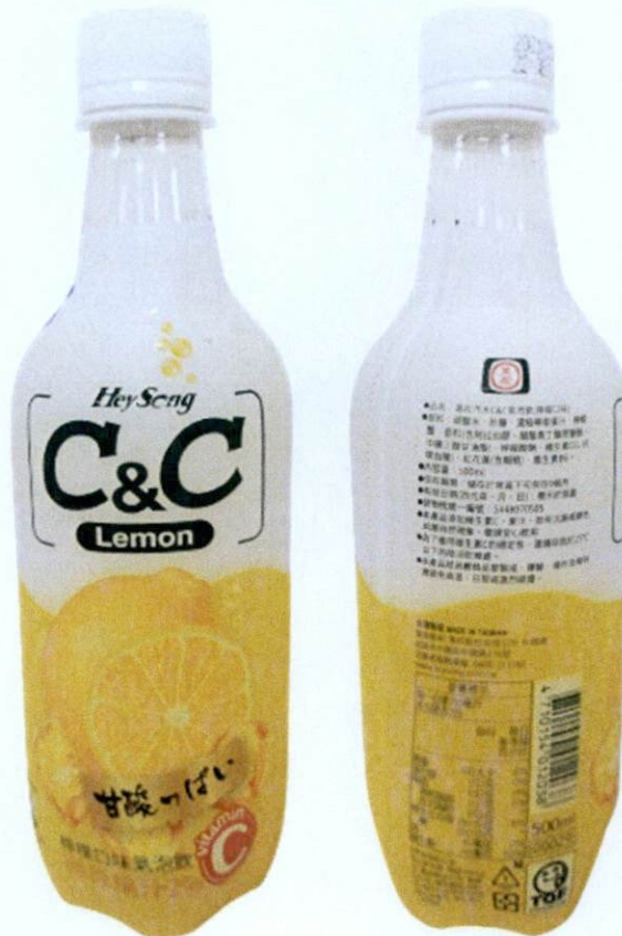
Figure 5. Unregistered HEYSONG C&C Lemon Drink in PET Bottle (In Foreign Language)