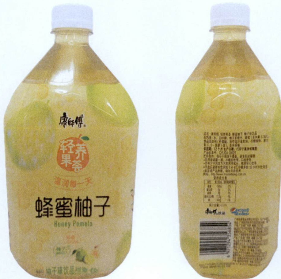
Figure 3. Unregistered Honey Pomelo Drink with Light Yellow Label in PET Bottle (In Foreign Language)