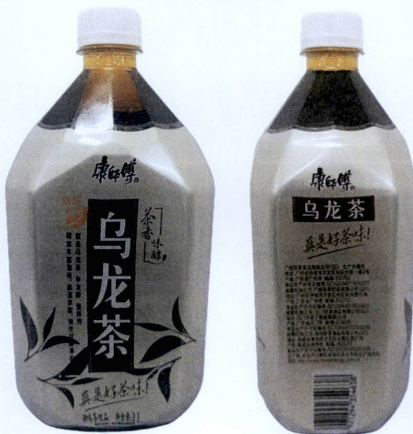
Figure 5. Unregistered Brown Drink with Image of Leaves and Silver Label in PET Bottle (In Foreign Language)