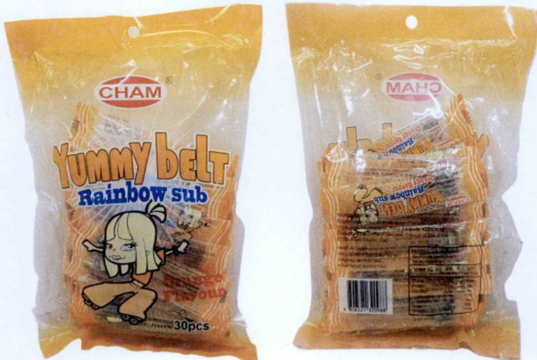
Figure 1. Unregistered CHAM Yummy Belt Rainbow Sub Orange Flavour

The Food and Drug Administration (FDA) warns all healthcare professionals and the general public NOT TO PURCHASE AND CONSUME the following unregistered food products: