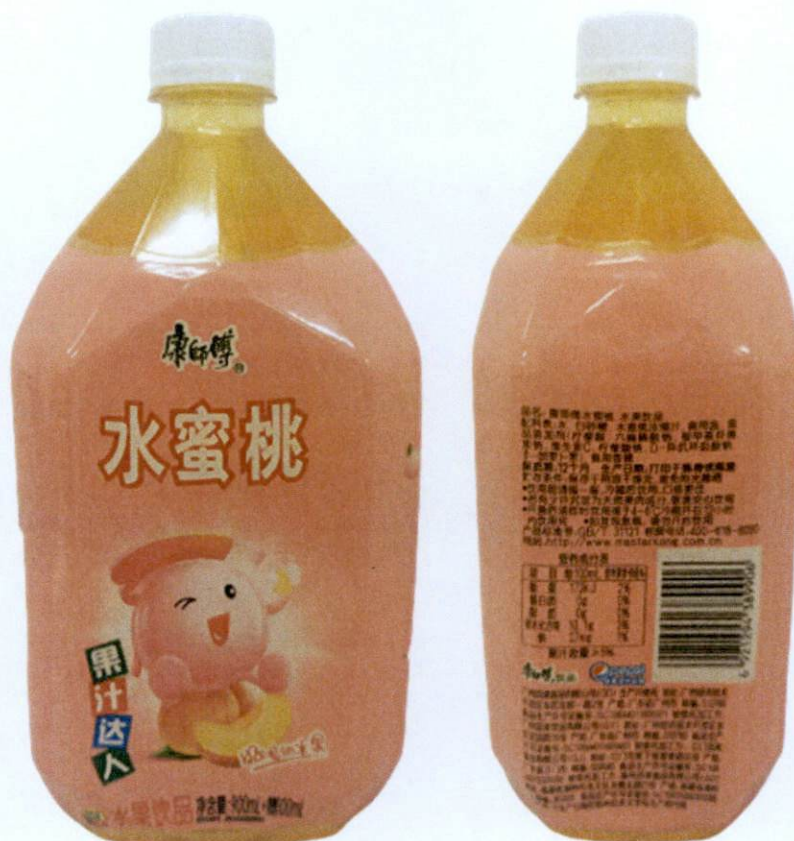
Figure 4. Unregistered Drink with Image of Peach and Pink Label in PET Bottle (In Foreign Language)