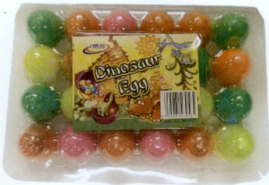
Figure 2. Unregistered MM Dinosaur Egg