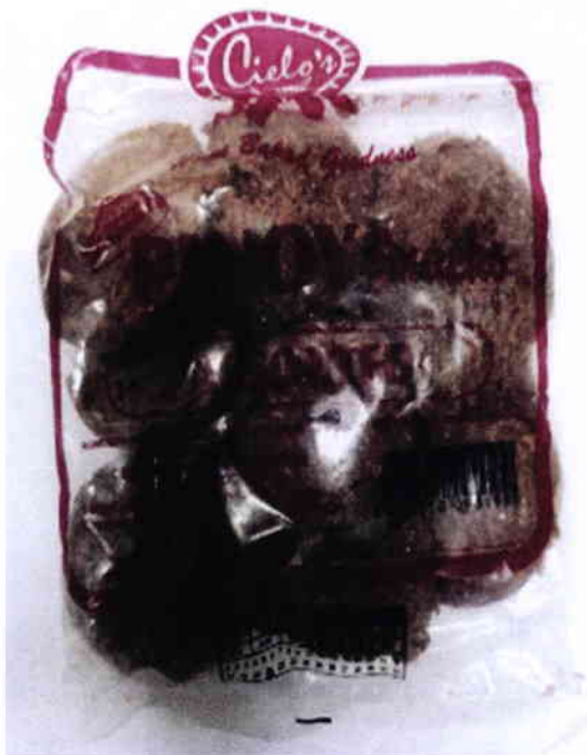
Figure 4. Unregistered CIELO'S Pinoy Snacks Assorted (Cookies)