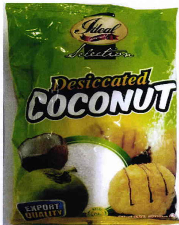
Figure 1. Unregistered IDEAL GOURMET SELECTION Desiccated Coconut, Net Wt. 200g

The Food and Drug Administration (FDA) warns all healthcare professionals and the general public NOT TO PURCHASE AND CONSUME the following unregistered food products: