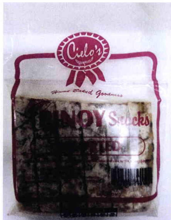
Figure 5. Unregistered CIELO'S Pinoy Snacks Assorted (Sweet Heart)