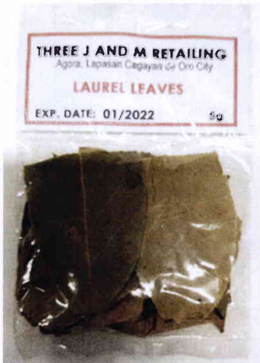
Figure 2. Unregistered THREE J AND M RETAILING Laurel, Leaves, 5g