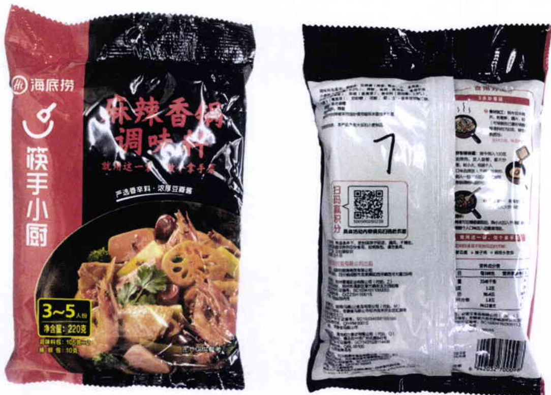
Figure 3. Unregistered HI Food Product with Shrimp, Lotus Root and Vegetables Image in Black and Red Packaging (In Foreign Language)