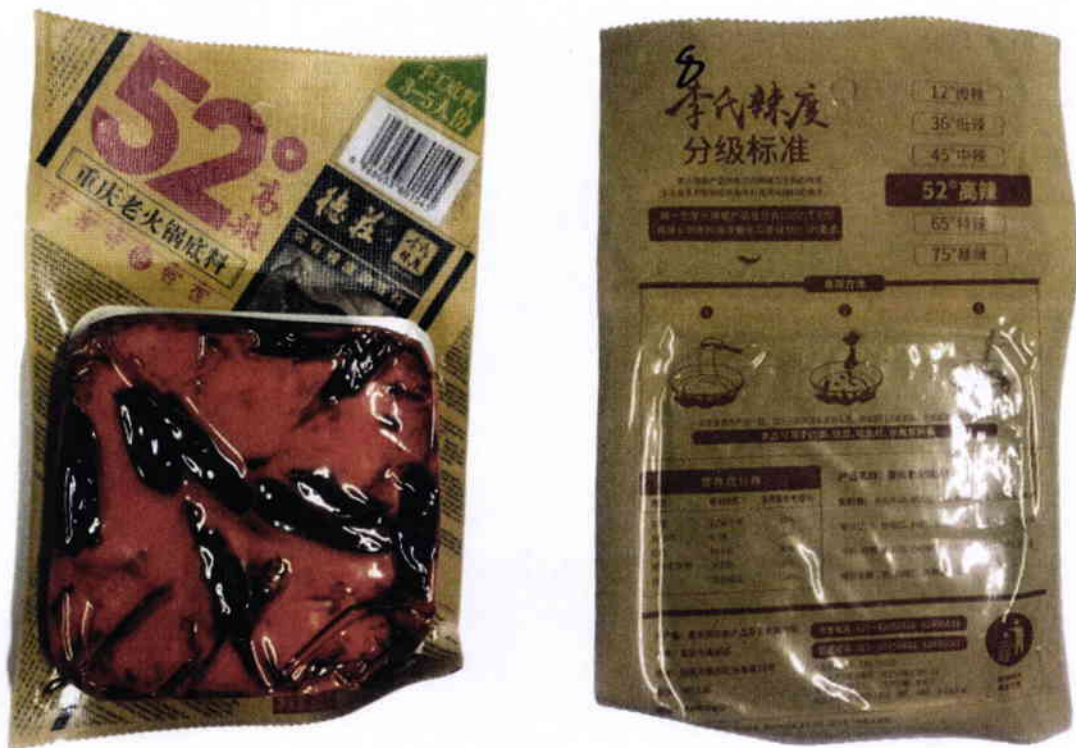
Figure 5. Unregistered 52° Sauce-Like Food Product in Gold Vacuum Sealed Packaging (In Foreign Language)