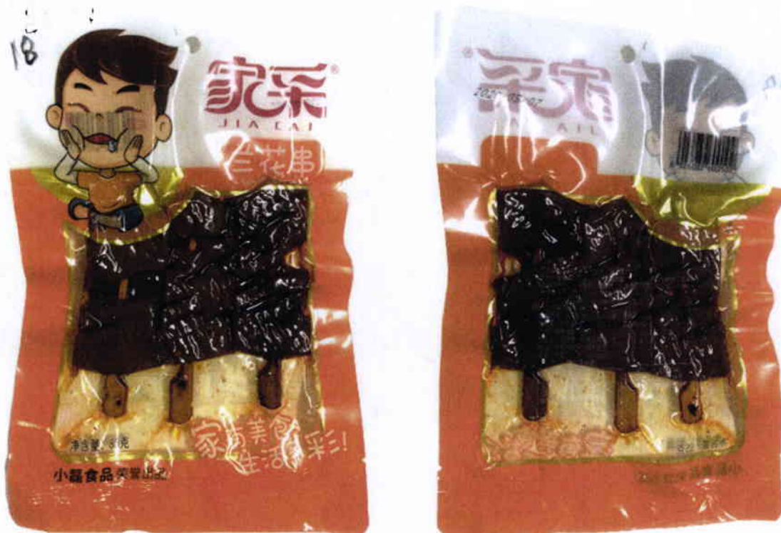
Figure 2. Unregistered JIA CAI Lan Hua Chuan Preserved Meat on Stick in White and Orange Vacuum Sealed Packaging (In Foreign Language)