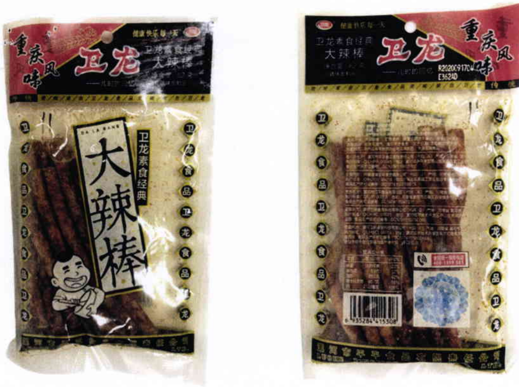
Figure 4. Unregistered DA LA BANG Stick-Like Food Product with Red, Black and Transparent Packaging (In Foreign Language)