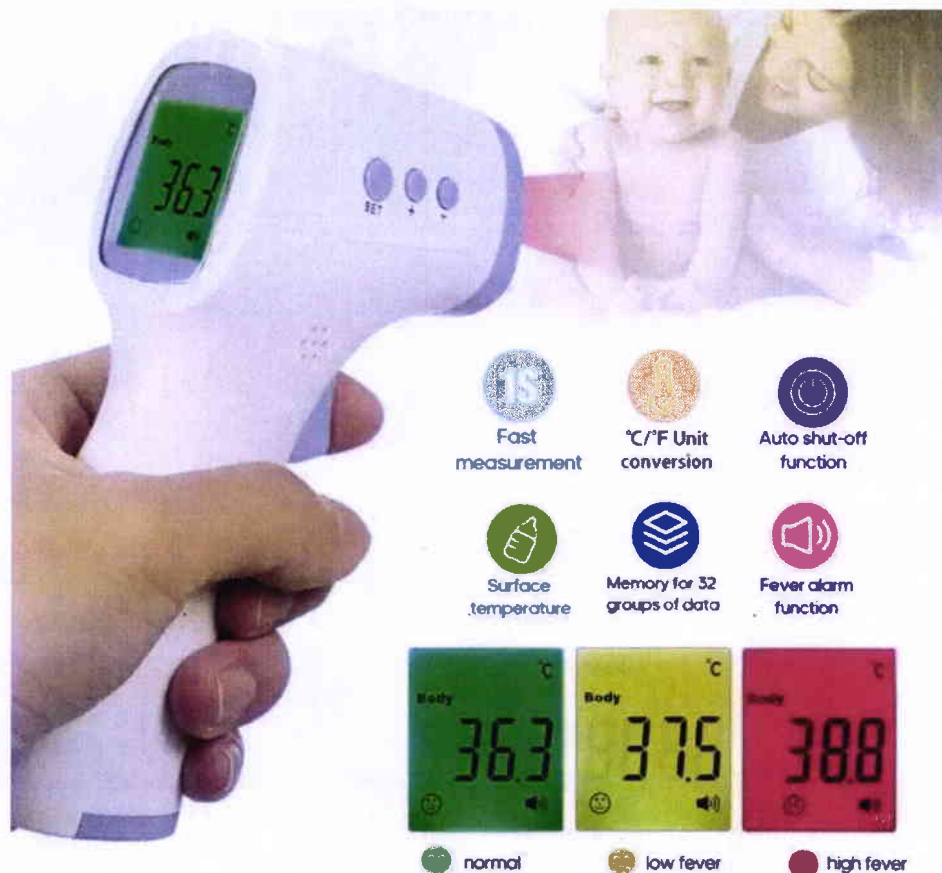
Figure 1. Unregistered Greenmoon Non-Contact Thermal Scanner IR Infrared Thermometer for Baby Kids Adult

The Food and Drug Administration (FDA) warns all healthcare professionals and the general public NOT TO PURCHASE AND USE the unregistered medical device product: