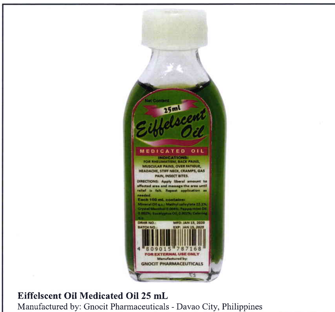
Eiffelscent Oil Medicated Oil 25 mL

The Food and Drug Administration (FDA) advises the public against the purchase and use of the following unregistered drug products: