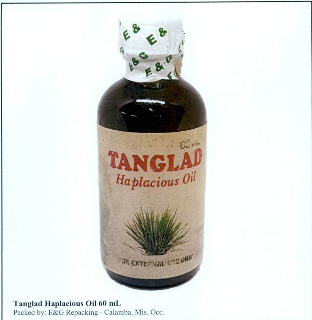
Tanglad Haplacious Oil 60 mL Packed by: E&G Repacking - Calamba, Mis. Occ.