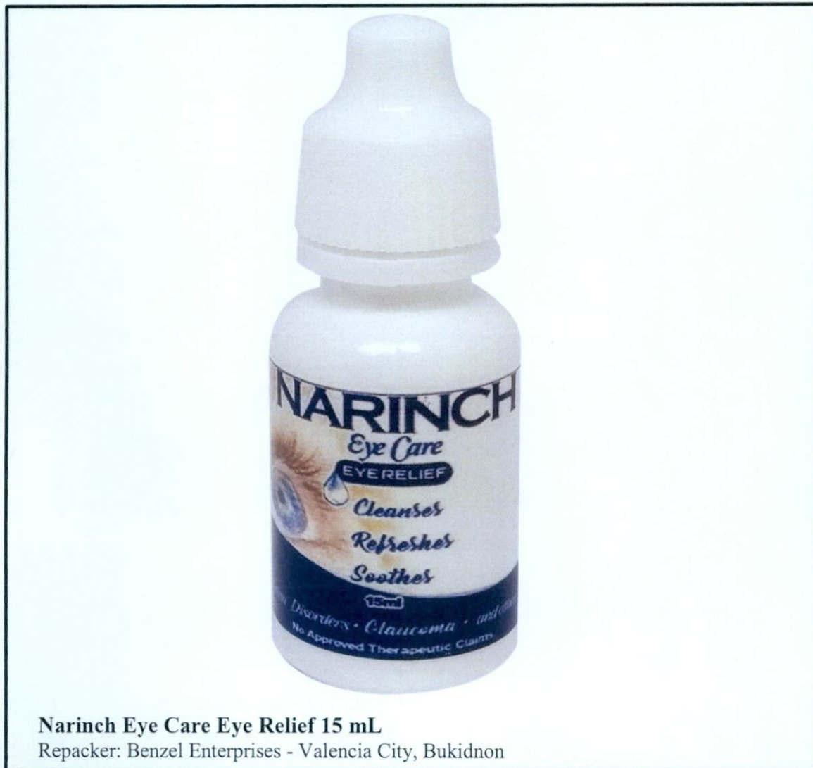
Narinch Eye Care Eye Relief 15 mL Repacker: Benzel Enterprises - Valencia City, Bukidnon

The Food and Drug Administration (FDA) advises the public against the purchase and use of the unregistered drug product: