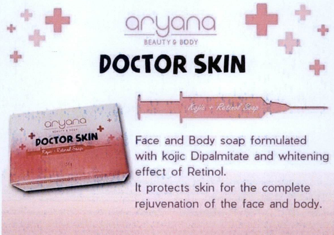
Figure 2. Unauthorized Product Aryana Doctor Skin Facial Serum