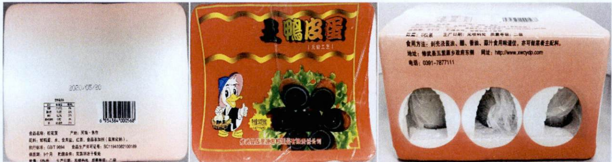
Figure 3. Unregistered Egg 6pcs packed in Styro with Red Label with Foreign Text and Duck Image, BARCODE:6934384000568