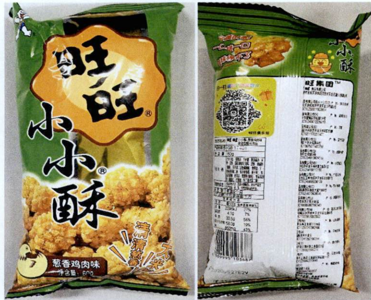
Figure 2. Unregistered Green, Gold and Yellow Food Pack with Foreign text, 60g BARCODE:6909995103687