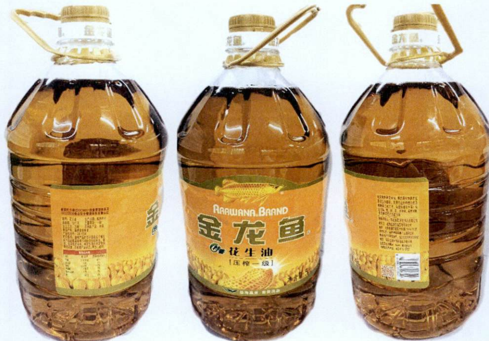
Figure 1. Unregistered ARAWANA BRAND Medium Brown Liquid in PET Bottle with Orange Label with Foreign Text and Peanut Image, 5L ,BARCODE:6948195800514

The Food and Drug Administration (FDA) warns all healthcare professionals and the general public NOT TO PURCHASE AND CONSUME the following unregistered food products: