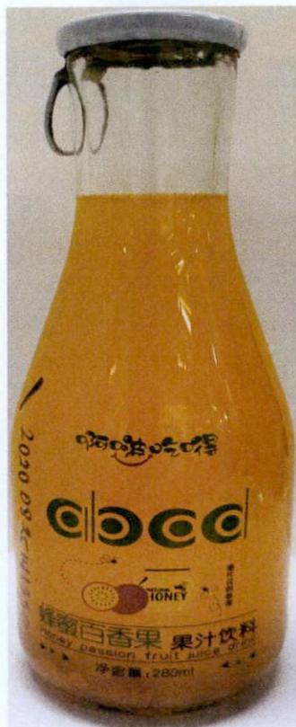
Figure 2. Unregistered Honey Passion Fruit Juice Drink, 280ml