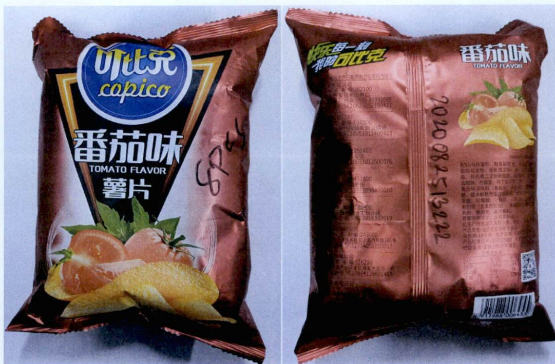
Figure 3. Unregistered COPICO Tomato Flavor (Chips)