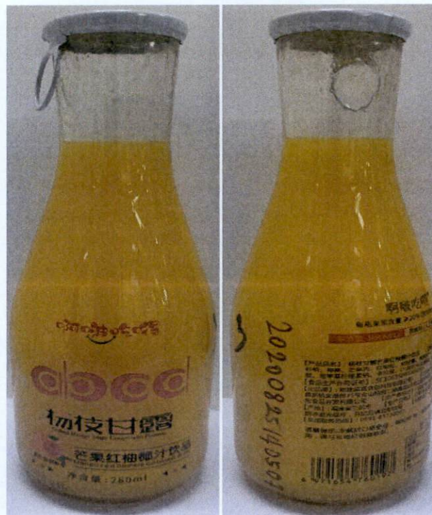
Figure 1. Unregistered Chilled Mango Sago Cream with Pomelo, Mango Red Pomelo Coconut Drink

The Food and Drug Administration (FDA) warns all healthcare professionals and the general public NOT TO PURCHASE AND CONSUME the following unregistered food products: